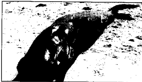
Fig.1. Sperm whale Physeter macrocephalus washed ashore at Irument (Palk Bay) near Mandapam

A female sperm whale Physeter macrocephalus Linnaeus (Fig. 1) measuring 4 m, weighing 1.5 t was washed ashore in dead condition at Irumeni (Palk Bay) near Mandapam on 10-11-2000. The length at birth of a sperm whale is about 4 meters, hence it may be in-