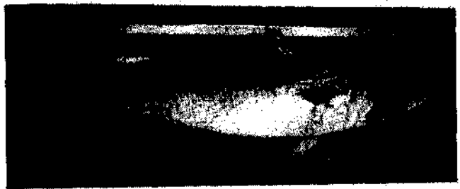
Fig. 1. Scomber japonicus .

Total length: 284 ; fork length : 255; standard length: 240; pre-dorsal length; 91 head length: 74, Pre-orbital length : 59; I dorsal base : 23 ; II dorsal base : 23; anal fin base: 20 and body depth: 70.