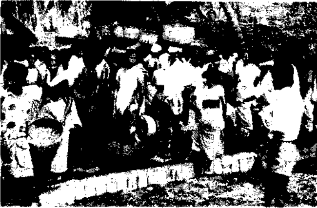
Fig. 1. Poor arrivals-hawkers in despair in 1980