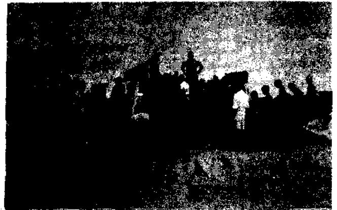
Fig. 6. Indigenous crafts auctioning catches