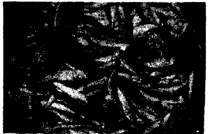
Fig.3 & 4. Bumper harvest of oil sardine in 1981.