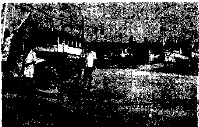
Fig. 5. Purse-seiners and carrier boats at Fisheries Harbour, Cochin.