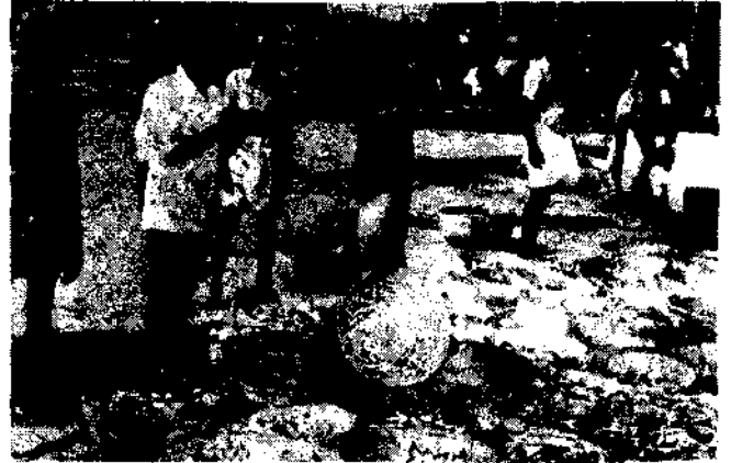
Fig. 2. Auctioning of indigenous catches of oil sardine in 1981.