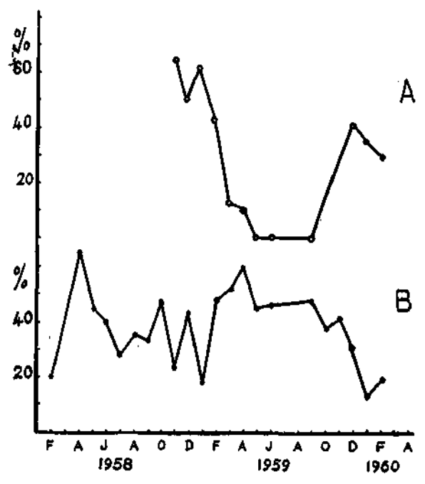
Fig. 1. Correlation between period of annuli formation in the scales and period of low feeding activity in Otolithoides brunneus . (A) shows monthwise percentage number of juvenile and adolescent fish with < 10 circuli in the 'terminal zone' in their scales. (B) shows monthwise percentage of average fulness of stomach (points method) of juvenile fish from the inshore waters of Bombay.

juvenile and adolescent 'Koth'* were made, as done by Perlmutter and Clarke (1949) in Sebastes marinus. The fish were then grouped into two categories, (i) those with < 10 circuli in the terminal zone of the scale and (ii) those with > 10 circuli in the terminal zone. The width of the sclerites was more or less uniform irrespective of the season when they were formed and the number of circuli in the scale increased with the growth of the fish. Consequently the period, when scales with the smaller counts of circuli (< 10 circuli) in the 'terminal zone' were dominant, would represent the period closely following the formation of an annulus. Curve A in Fig. 1 shows