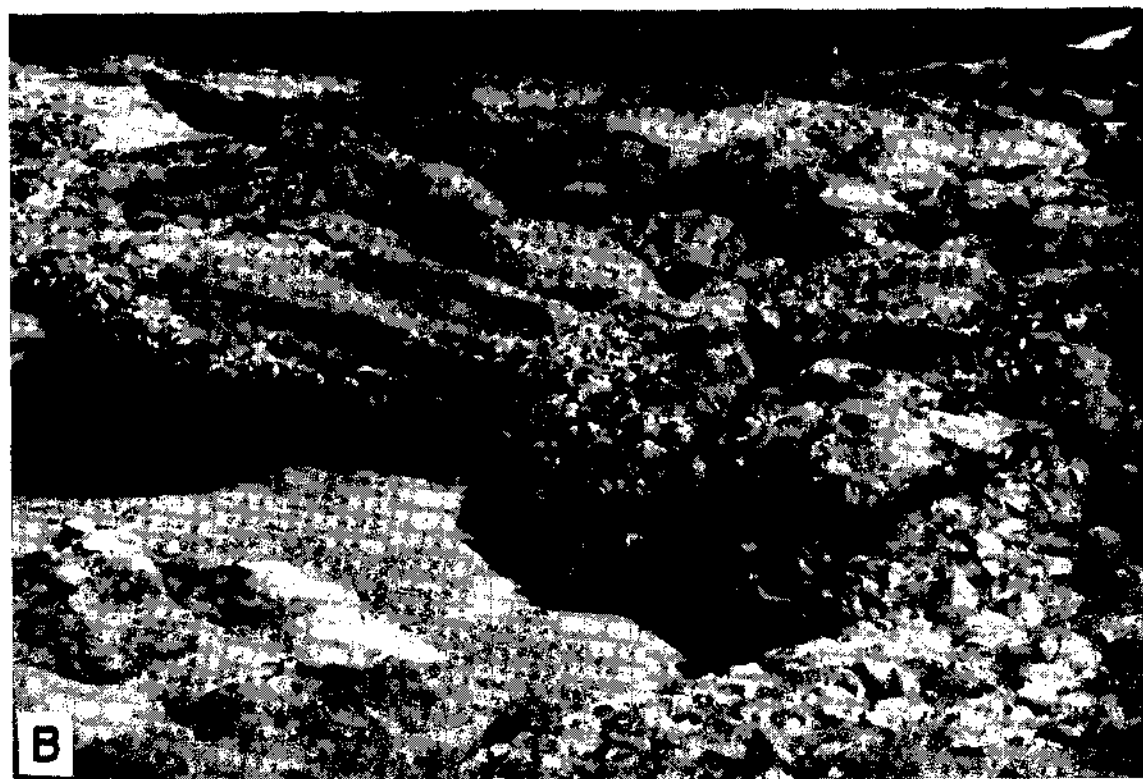
PLATE I. A— Crassostrea madrasensis on the R.C.C. jetty in Mayabunder. B— Saccostrea cucullata on the intertidal rocks in Havelock Island,