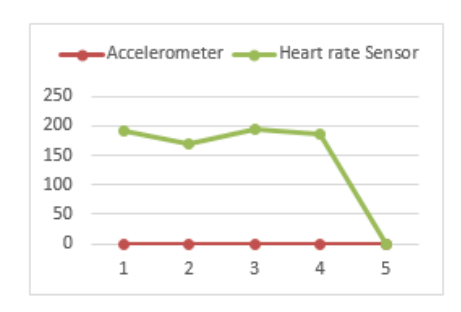
Figure 2. Graph between accelerometer and heartrate sensor