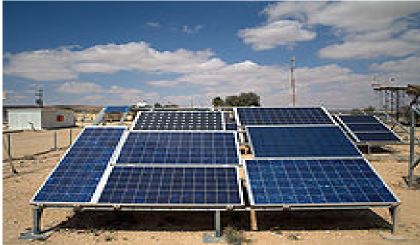
Figure 2. Photovoltaic array

First, high reliability - it has no moving parts which make it particularly suitable for remote areas. This is due to its use on spacecraft. Then, the modular nature of photovoltaic panels allows a simple and adaptable to various energy needs. Systems can be designed for power applications ranging from milliwatts to megawatts.