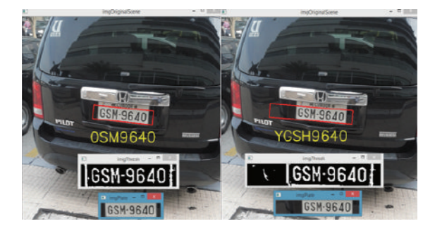
Figure 13. False positive depiction