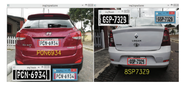
Figure 14. Closed-form characters depiction

Alteration during the recognition process occurs depending on the inclination angle of the captured image [25, 26], limiting the recognition area or altering the characters. There are successful cases where an image is captured with either a front or a rear profile without inclinations and with standard font letters with adequate accuracies, such as the ones mentioned in [27]. In our case study, a factor that affects the accuracy relationship was the inclination angle during the capturing of the characters as shown in the Figures 15(a) and 15(b). Table 1 depicts a match percentage of the algorithm when recognizing the characters from all the captures done.