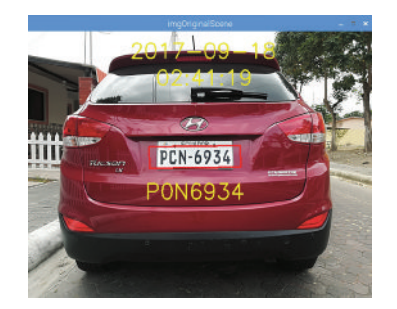
Figure 7. Character recognition simulation