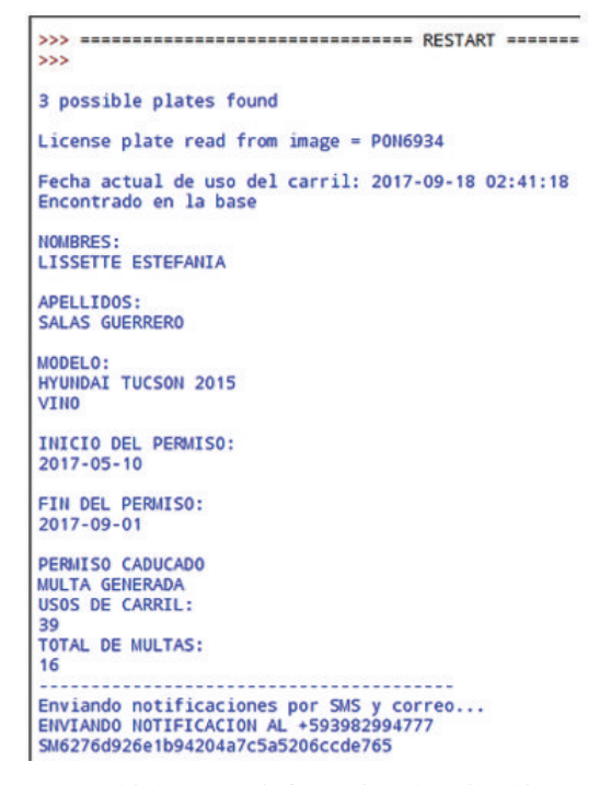
Figure 8. Vehicle owner information described in Spanish

A database that stores the information links a MySQL connector with the hostname to validate a username and a password, specifying the database name that saves the table with the vehicle information that passed with permission. A cursor creation is necessary to specify the lecture parameters for information depiction by console regarding a vehicle that has occupied the exclusive lane. The action selects license plate information depicting as a string per console as shown in Figure 8, and checking permission parameters and its use. Additionally, the system verifies whether the permission is expired or not by comparing its validation period with the current date. Registry commands use the updated information for depicting information through the database (e.g., name, e-mail, cell phone number, permission validity) of the authorized vehicles that paid the fee to occupy the exclusive lanes as depicted in Figure 9. An object calls a method to use sending arguments such as subject and recipient for the e-mail notification process, previously associating an account with the mail server for linking the object argument for the e-mail recipient.