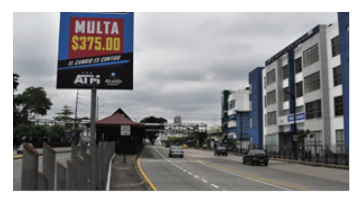
Figure 1. Lane invasion signboard warning [3] (Note: the fine is not updated)

mechanical parts wear due to continuous jams; noise contamination and gas pollution. Because of traffic jam experiences, lane exclusiveness takes out during some periods and paths. As traffic intensifies, traffic officers allow lightweight vehicles to transit exclusive lanes [5] as traffic intensifies, whether reducing or intensifying congestion, not providing effectiveness and efficiency. Researches pursue traffic allocation to less congested routes, optimizing schemes for rerouting traffic, socializing direct benefits to drivers for enhancing path choices. Vehicular congestion issues can be addressed by system automation to provide alternative paths through not congested roads [6].