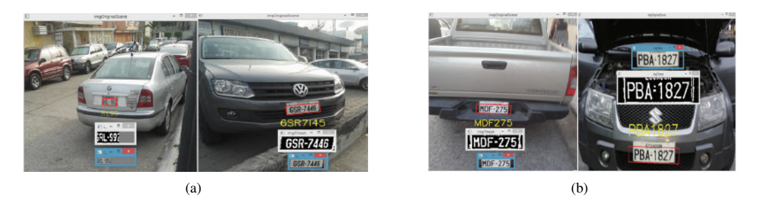
Figure 15. Captured images, (a) with altered information (b) with correct information

Alteration during the recognition process occurs depending on the inclination angle of the captured image [25, 26], limiting the recognition area or altering the characters. There are successful cases where an image is captured with either a front or a rear profile without inclinations and with standard font letters with adequate accuracies, such as the ones mentioned in [27]. In our case study, a factor that affects the accuracy relationship was the inclination angle during the capturing of the characters as shown in the Figures 15(a) and 15(b). Table 1 depicts a match percentage of the algorithm when recognizing the characters from all the captures done.