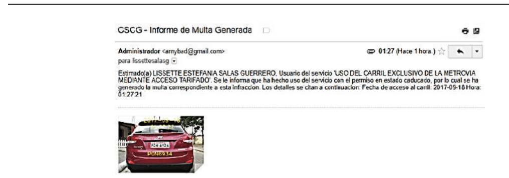
Figure 10. E-mail with information of the fine

Short message service (SMS) notifications ask some parameters registered in the database, such as information of a cloud account with the respective authorization [18]. A client parameter function object sends a message specifying the recipient and the cell phone number registered in the system warning to the owner that his/her vehicle has occupied an exclusive lane with an expired permission as shown in Figure 11. After sending a notification, another table adds information about the number of the generated fines such as the date and time of the infraction, image name, user information, and the license plate as depicted in Figure 12. Case studies where SMS notifications were deployed in different scenarios with the respective results are available in [19–24].