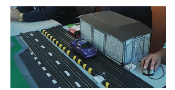
Figure 3. Lab test with a mock-up

An algorithm processes the photos based on neural networks trained for character recognition [14]. Data acquisition and an OpenCV library training function return a Boolean value: If false, there are problems in the file loading process; otherwise, if true, the process continues asking the photo captured after passed the infrared barrier, saving it into the coding files to identify the license plate, creating copies to generate the fine. For other sensed vehicle, the photo overwrites the photo captured at that instant. A reading function of the OpenCV library loads the photo image [15], and a detection function returns a region list where a rectangular area for license plate recognition finds alphanumeric characters whereas a preprocessing function performs color conversion to HSV in the photo image by extracting values [16] from the OpenCV library [15]. A segmentation function links to the photo image channels, setting addition and subtraction operations to maximize contrasts for removing gray-scale image noises [17], converted previously into erosion and dilation. Moreover, the first filtering removes the Gaussian noise, making it possible to change images to gray-scale as shown in Figure 4(a) for comparing each pixel of the threshold and getting its binary form as shown in Figure 4(b). With the binary image, the algorithm starts searching the license plate varying the gray-scale image and marking rectangles until finding the largest one as depicted in Figure 5.