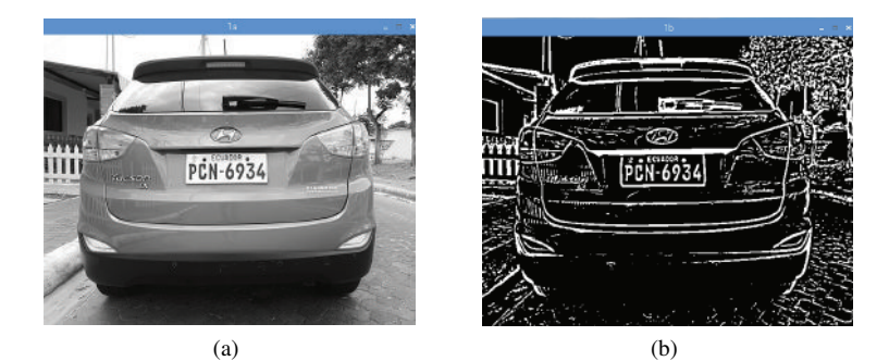
Figure 4. License plate image, (a) in gray-scale (b) in binary

it is into the delimited area of the license plate, the recognition analyzes a returning character list. The area that contains the non-null characters in the license plate region draws a rectangle around it. Both console and dated images present the identified license plate as shown in Figure 7, displaying into an original image window and saving it into a folder if the process analysis determines the permission status has expired.