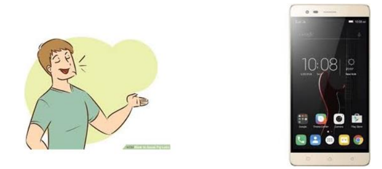
Figure 3. Recording of speech database using mobile phone