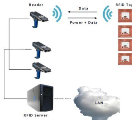
Figure 4. The basic model of networked RFID system