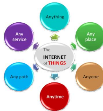
Figure 1. Internet of things connectivity

It is mostly perceived that the cutting edge web will be the IoT which statement individuals and things to be associated whenever, wherever, with anything and anybody, preferably profit any way/organize and any help [16-18], as shown in Figure 1. Radio recurrence recognizable proof innovation is for the most part observed as a key empowering influence of the web of things, on account of its capacity to help machines or PCs to distinguish items and track an enormous number of remarkably recognizable articles, minimal effort, little size and low-upkeep highlights [19, 20]. For example, the electronic product code class-1 generation-2 (EPC C1 G2) ultra high frequency (UHF) passive RFID protocol allows low-cost tags and has been widely used in supply chains [20]. Arranged RFID frameworks through servers are required because of the constraint of understanding reach and the basic structure of labels, and ordinarily have a various leveled structure comprises of three principle layers: an upper system, a center system and a lower organize as appeared in Figure 2. There are three primary kinds of segments: servers, perusers and labels. They are associated in three-chain of importance systems [20].