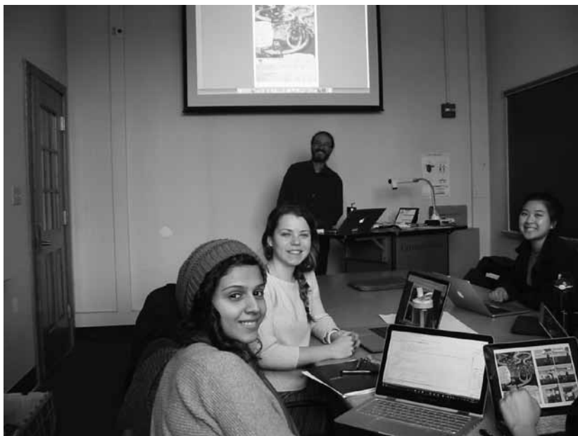
Figure 5. The lead researcher with some of his students in the Fall 2017 pilot course.

The pilot Hispanic Studies course “Comics, Community, and Coding: Electronic Textuality and Culture in Latin America” was offered over the Fall 2017 semester at our institution (Figure 5). As part of the Hispanic Studies curriculum, the objectives for this topics course included standard linguistic and cultural competence goals for the 4 th year, aimed at strengthening and improving skills for active interaction at the high intermediate level with individuals within the Hispanic world and/or for more advanced classes in Hispanic studies. It also introduced specific content goals related to Latin American comics, the context for their development, production and reception, and their relevance and importance within the field of cultural studies. Given that these pilot courses are based on a 21st century digital-age approach to academic literacy aligned with today’s standards, they are also meant to convey basic literacy in DH, and provide sufficient grounding from which to gain further knowledge in order to better understand how the visuals we deal with on a day to day basis produce meaning. DH objectives introduced were aimed at learning the basics of CBML and using this language to contribute to encoding comics for the LACA, while at the same time having the coding process be an additional tool to develop literacy by learning how to read comics critically in order to identify and analyze key elements of the genre and its relationships to societal issues.