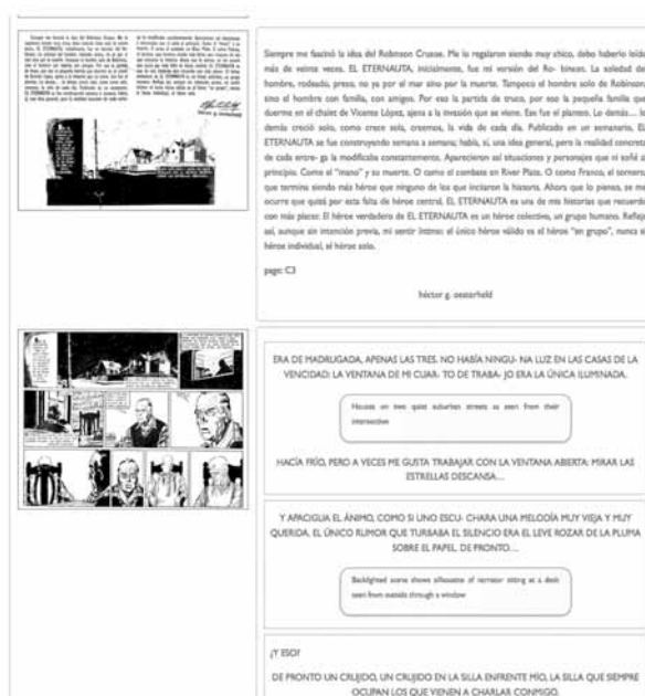
Figure 4. Screen shot of page view on the Omeka platform.