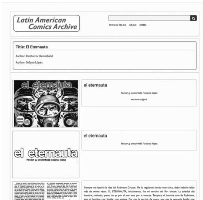
Figure 3. Screen shot of page view on the Omeka platform.