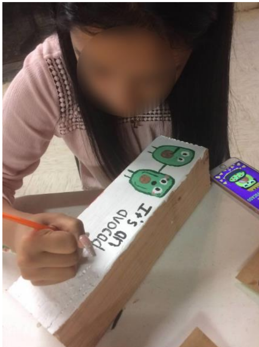
Bee box being painted by a female participant in the first cohort.