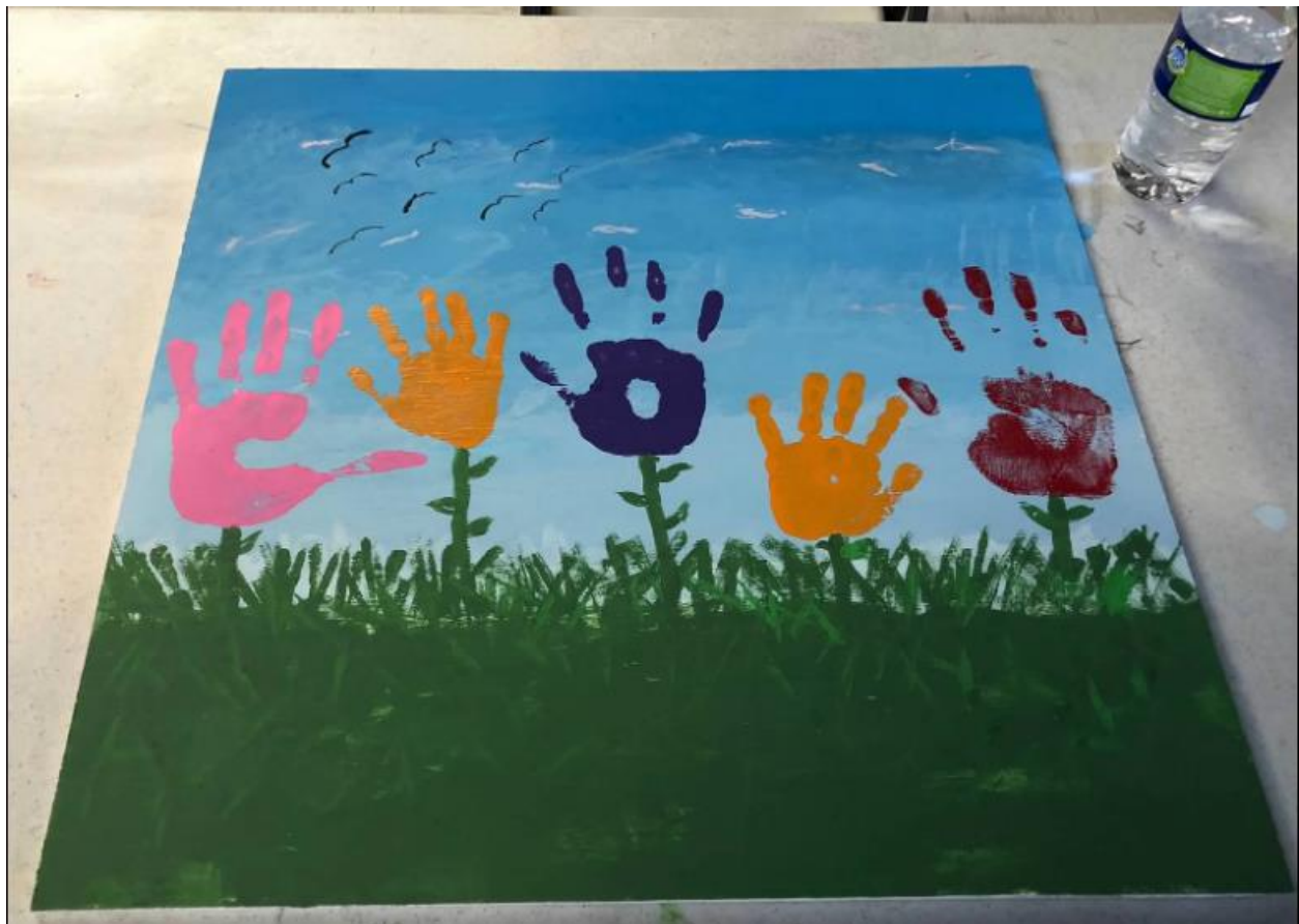
Planting a Future with Youth Designed and painted by youth participants