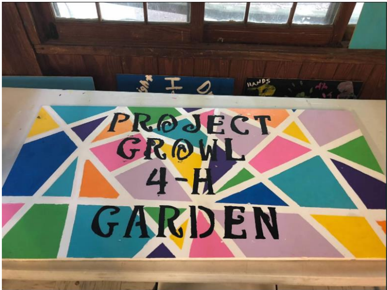
Project GROWL 4-H Garden sign designed and painted by youth.