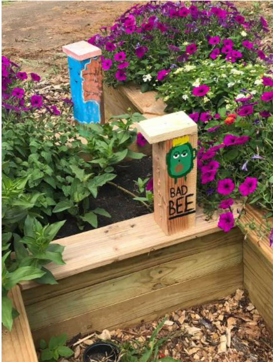
Bee boxes, constructed and painted by youth participants, set up in a pollinator garden bed.