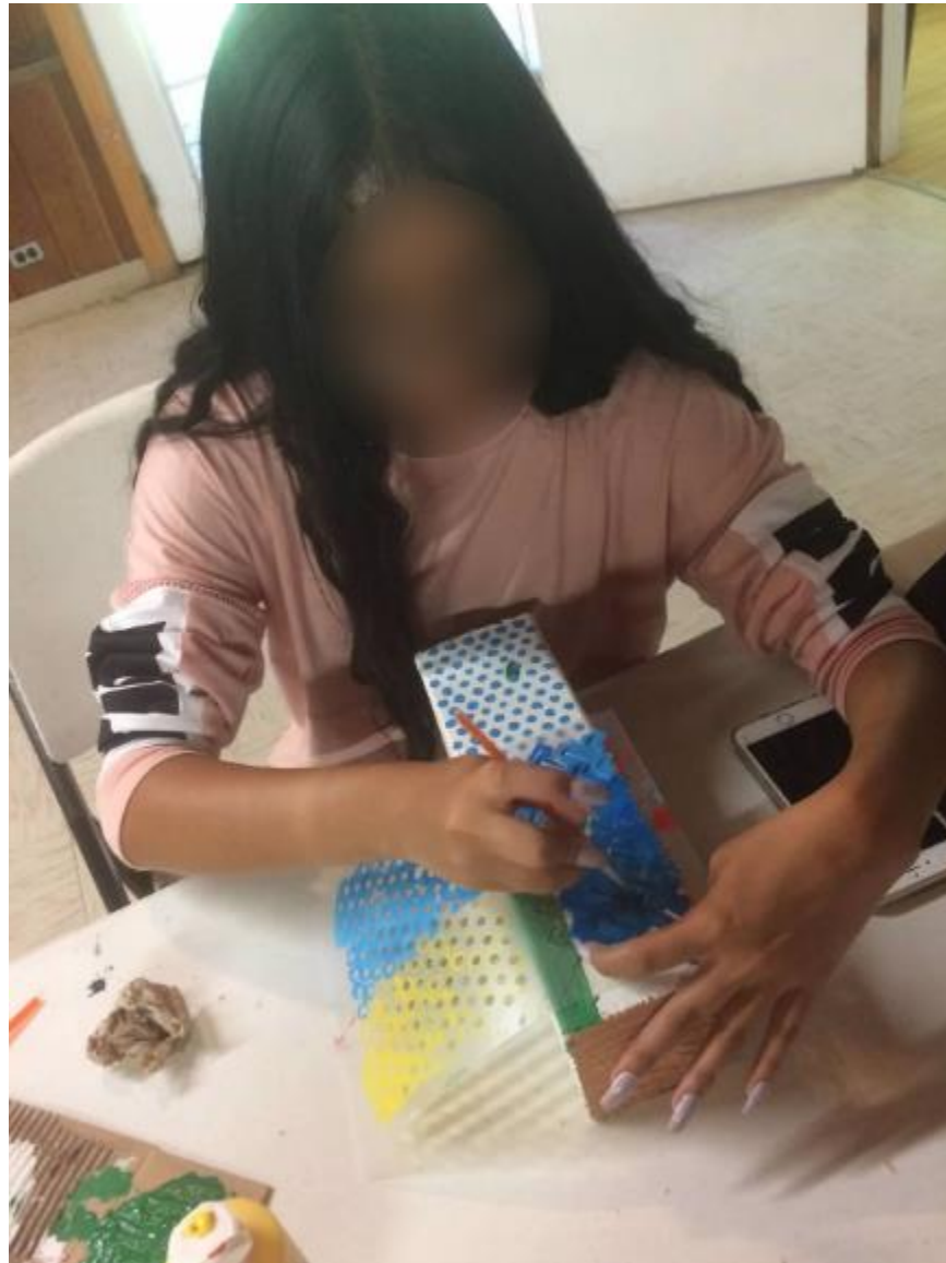
Bee box being painted by a female participant in the first cohort.