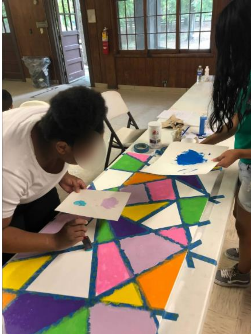
Early stages of Project GROWL 4-H Garden sign designed and painted by youth.