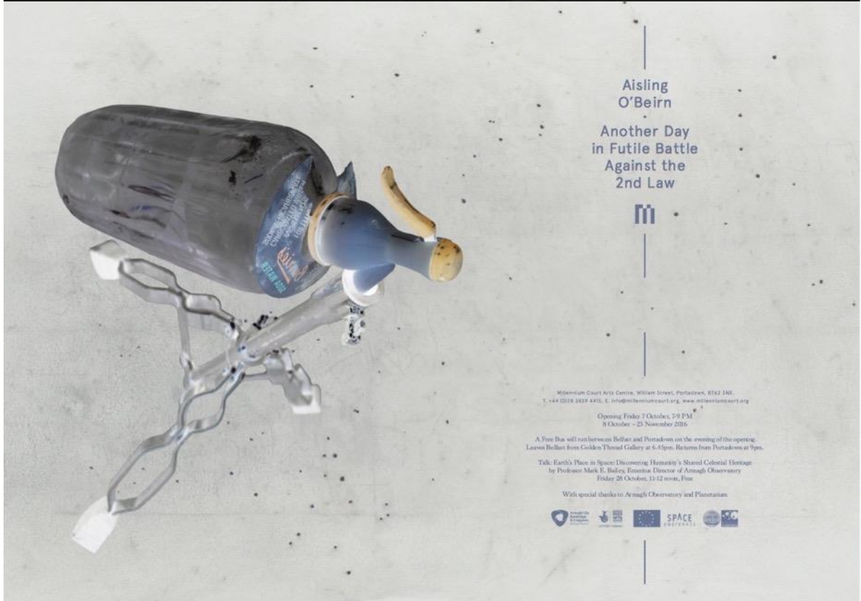
Another Day in Futile Battle Against the 2nd Law, invitation