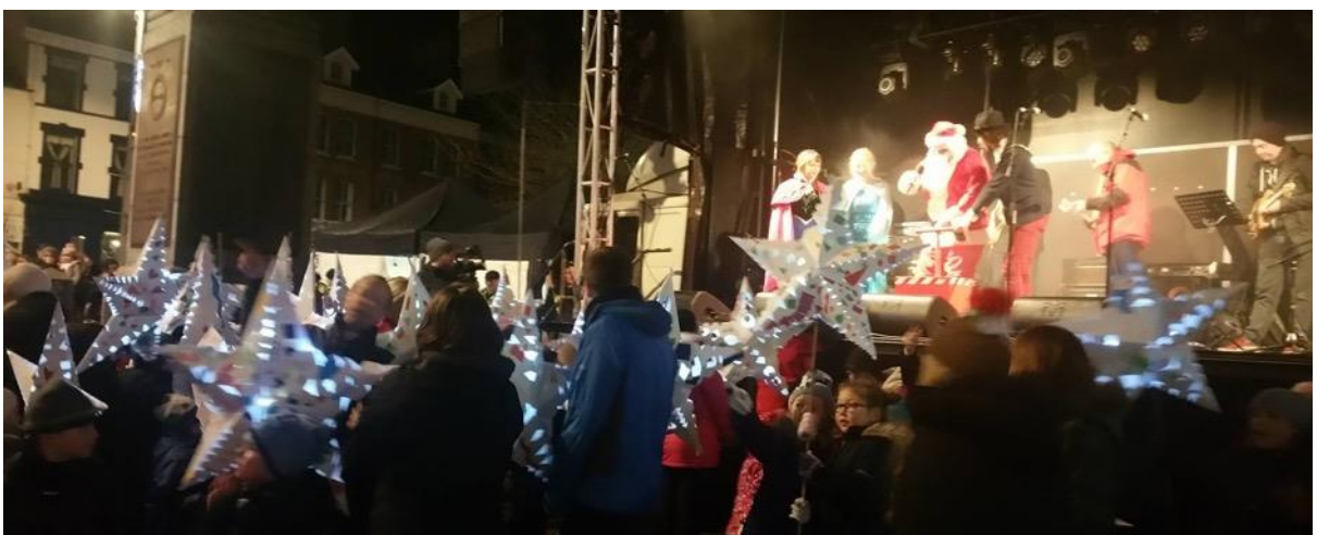
Millennium Court Lantern parade event 22 nd Nov 2016 from Another Day in Futile Battle workshops