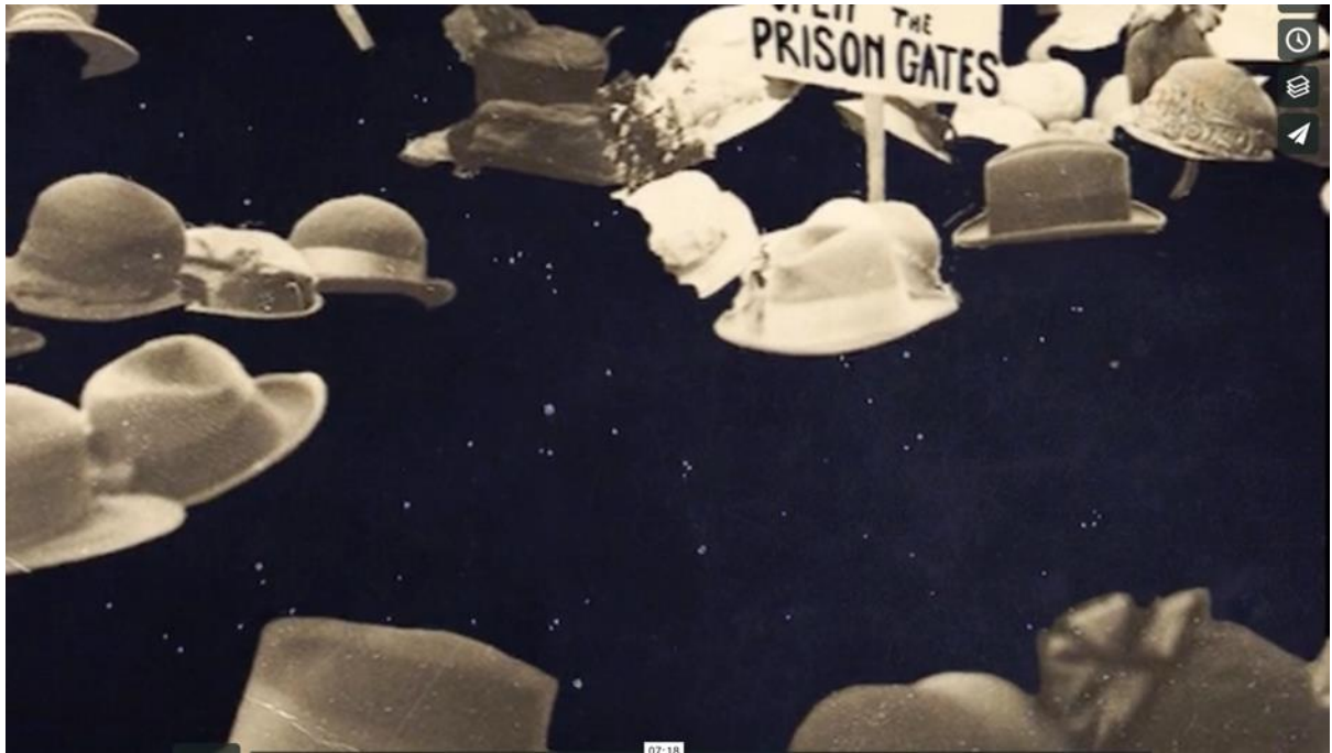
Vastness (Meteor Showers) still, HD Video 14 min 24 sec Sound track Boris Völt, courtesy TONN Recordings