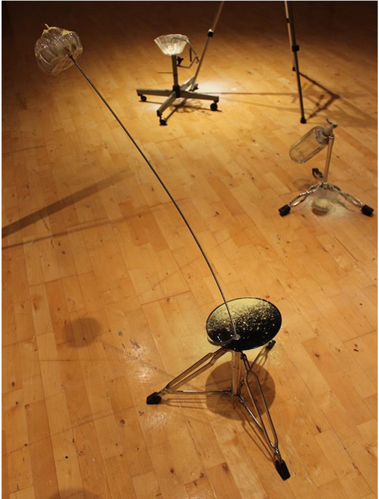
Another Day in Futile Battle Against the 2 nd Law, (Uma Upsillion)