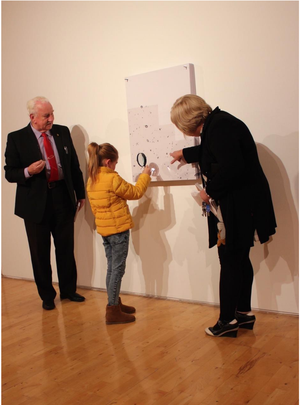
Visitors examining Deep Field with magnifying glass