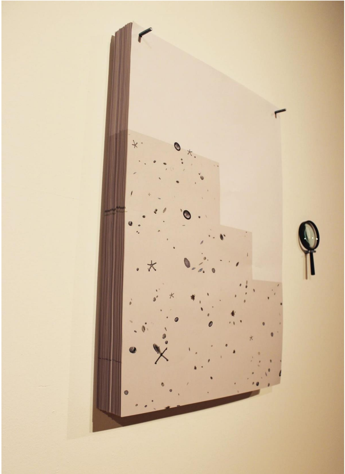
Deep Field , A1 posters edition of 500