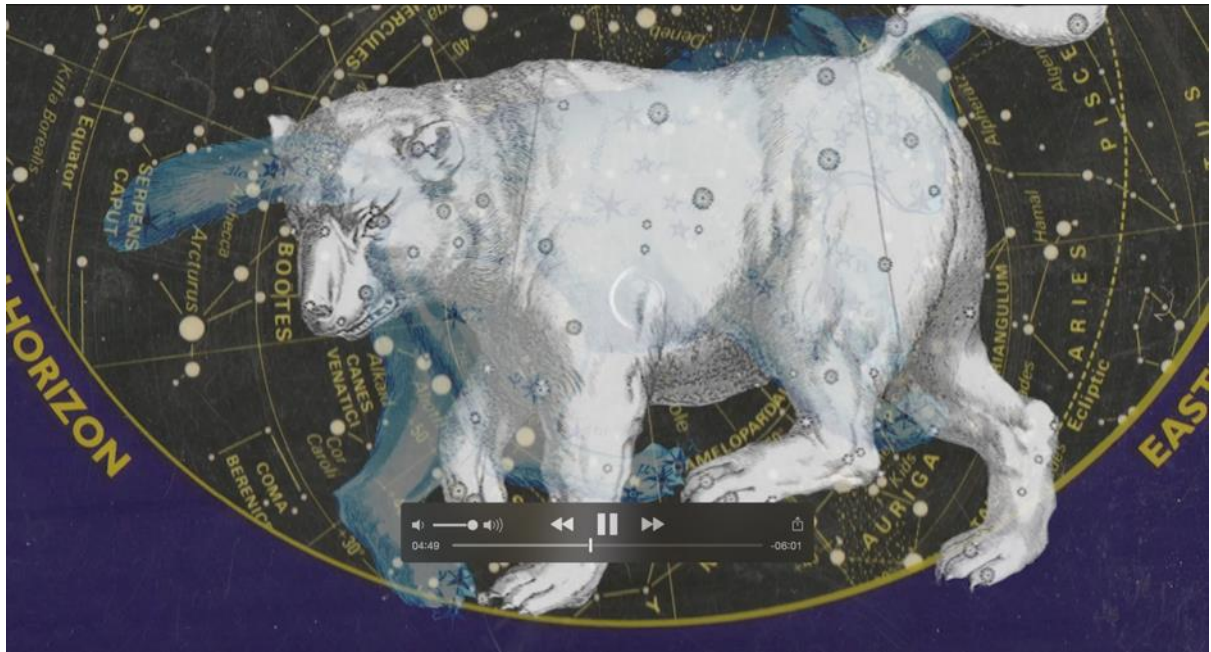
Slices of Time (some questions) HD Video, 10 min 50 sec, with thanks to S. Jeffery Armagh Observatory and Planetarium