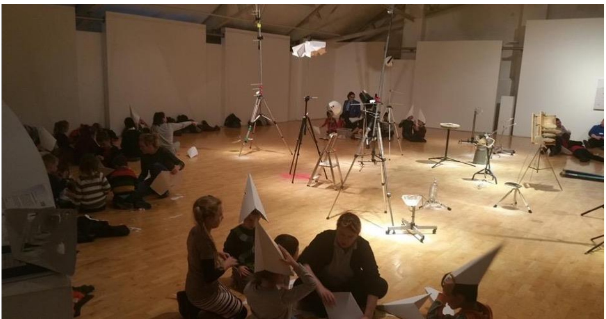
Millennium Court Arts Centre Lantern parade workshop event relating to Another Day in Futile Battle