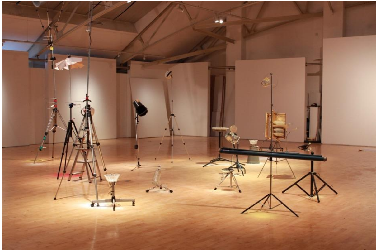
Another Day in Futile Battle Against the 2 nd Law, (Ursa Major) , installation shot gallery 1, mixed media, dimensions variable

The Second Law of Thermodynamics States that whenever energy is transformed from one form to another form, entropy increases and energy decreases. The work for this exhibition falls under the 2nd law. O'Beirn used sculptural means to try to understand spatial relationships and physical properties of the stars whilst attempting to come to grips with the inevitable slide from order to chaos. The work, developed through over a year of dialogue with and support from astronomers from Armagh Observatory and Planetarium, consists of a sculptural installation and some new animations pieces, all of which explore in different ways how a lay-person struggles to understand scientific concepts. The installation explores stellar distances by spatially imagining the constellation the Great Bear, using precariously balanced and placed found objects.