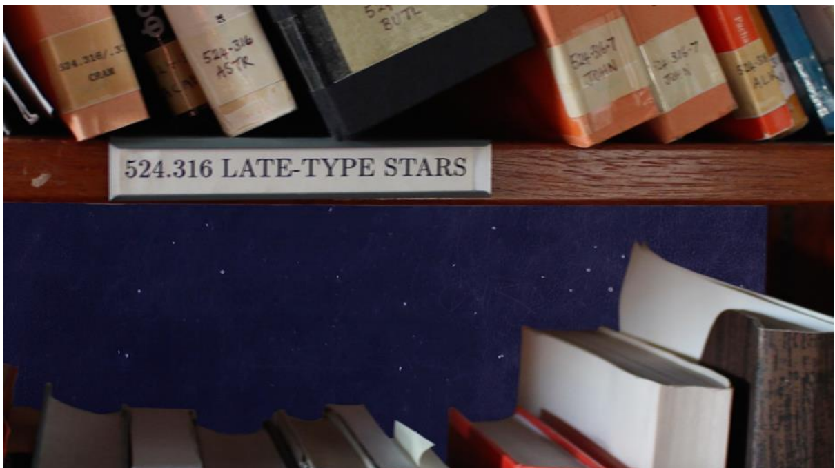
Slices of Time (some questions) HD Video, 10 min 50 sec, with thanks to S. Jeffery Armagh Observatory and Planetarium