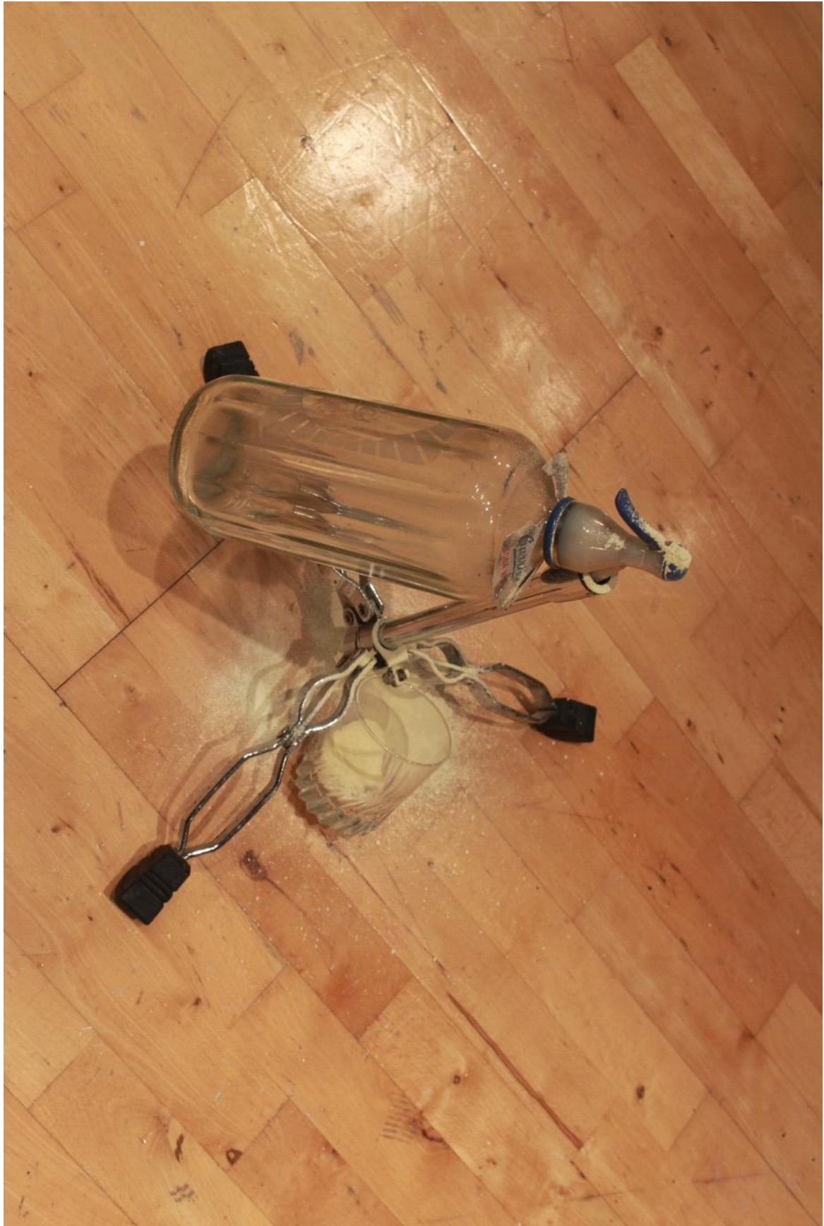
Another Day in Futile Battle Against the 2 nd Law, (Uma Theta)