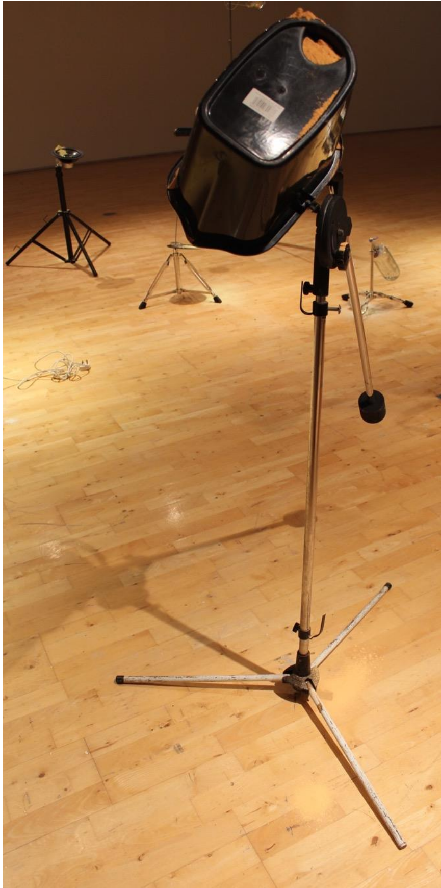
Another Day in Futile Battle Against the 2 nd Law, Uma