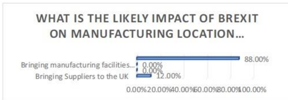
Figure 2a: Impact of Brexit on manufacturing location decisions

Figures 2a and 2b respectively present the likely impact of Brexit on manufacturers' and distributors' location decisions. As the results indicate, it is likely that Brexit will lead to more manufacturing companies shifting their facilities to the EU, in other words offshore their manufacturing activities (Moradlou & Backhouse 2016), while for distributors it appears that Brexit will result in more distribution centres coming to the UK. This can be seen as reshoring strategy (Moradlou, et al. 2017).