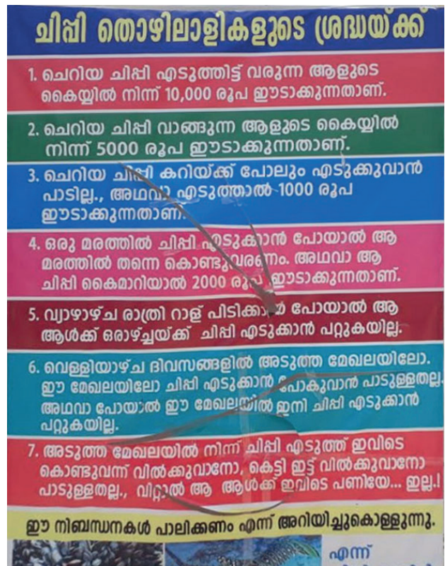
Fig.2. Poster with self-imposed regulations of the mussel fishers