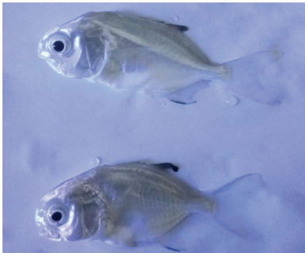
Fig. 1. Amyloodinium sp. infected juveniles of Trachinotus blochii showing emaciated body

formalin bath treatment for 3 consecutive days and this was effective against amyloodiniosis . Copper sulphate at the rate of 0.2 ppm is reported for treating Amyloodinium sp. in marine ornamental fishes. Therefore, in the present study some fishes were treated with copper sulphate at the rate of 0.2 ppm but it was not as effective as other drugs in snubnose pompano. Use of copper sulphate is also not advisable in food fish due to its ichthyotoxic / algicidal nature and accidentally if the level goes beyond 0.2 ppm may cause mass mortality of fishes. Besides other methods, freshwater dip treatment is an effective option during the initial stages of infestation. The fish with initial stages of infestation responded to the treatment but advanced stage of infested fish succumbed to acute mortality. Further in the bio-filter connected re-circulatory tanks, the fishes were heavily infested than in the rearing tanks without biofilter due to the reason that the bio-filter retains the encysted tomonts that later proliferate into dinospores. Hence, installation of ozonizers and UV sterilizers for intake seawater treatment along with periodical cleaning of rearing tanks with liquid bleach may keep away the amyloodiniosis infections from the marine fish hatchery.