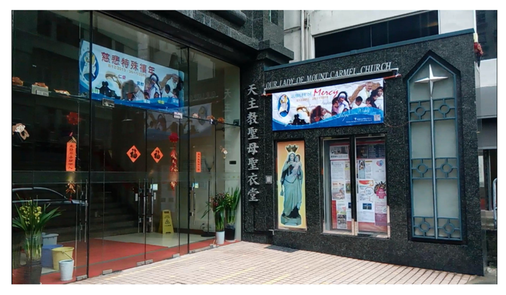
Photo 1. The sidewall next to the entrance of OLMC.

Church redevelopment is a process of remaking the sacred space. These conflicting property claims show that the land system defines the terrain for property struggles. Through different legal instruments such as land lease, private property rights and land ownership, conflicting property claims are settled. Those who claim a legally recognized property ownership right can often dominate the struggles.