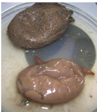
Figure 2. Body of M. polymorphus and its tunic