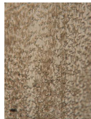
Figure 4. Siphonal spines with thin bands.