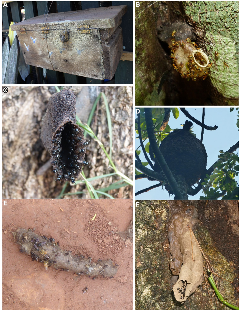
Fig. 2 Examples of substrates where stingless bees were collected. a Hive of Tetragonisca fiebrigi in a meliponary; b natural nest of T. fiebrigi inside tree trunk; c entrance of natural nest of Lestrimelitta chacoana on tree trunk; d aerial external nest of Trigona spinipes ; e foragers stingless bees and honey bees on feline fecal matter; f nest entrance of Scaptotrigona aff. postica in a tree trunk

final extension of 5 min at 72 °C. The amplified product was analyzed using 2% agarose gel electrophoresis and ethidium bromide staining. The positive PCR products were purified using a gel extraction kit (Wizard® SV Gel&PCR Clean Up, Promega Madison, Wisconsin, USA) and sequenced (Biotechnology Resource Center, University of Cornell, Ithaca, USA). The sequences were analyzed using Basic Local Alignment Search Tool (BLAST) software.