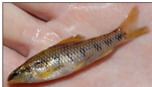
fig 2. (above). Characidium heirmostigmata , upon capture. MLP 10750, arroyo Garuhape