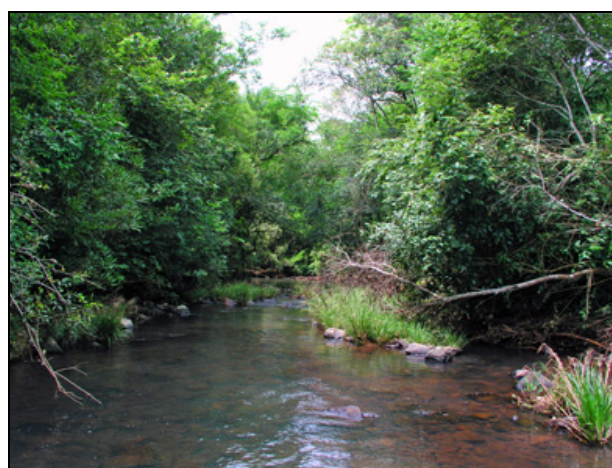
fig 4. (right). Arroyo Shangay at low-water, río Uruguay basin, Misiones Province