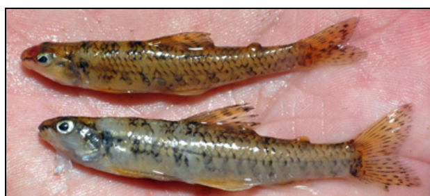
fig 3. (above). Characidium serrano , upon capture. MLP 10751, arroyo Shangay