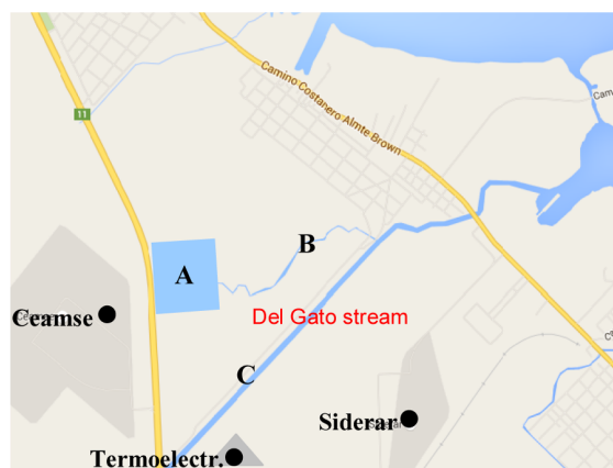
Figure 1 Map of the study area: Los Patos Lagoon (A), El Zanjón stream (B) and Del Gato stream (C)

As shown in Figure 1, Del Gato stream flows through the ground in SW-NE, and lagoon communicates with the stream by a small channel of just over 1 km called the Zanjón, and the whole system ends later in the Santiago River to finish in the river of La Plata. To the left of the lagoon is Diagonal 74 Street, the main route of communication between Punta Lara and the city of La Plata, which is a physical division with the sanitary landfill of Coordinación Ecológica Área Metropolitana Sociedad del Estado (CEAMSE).