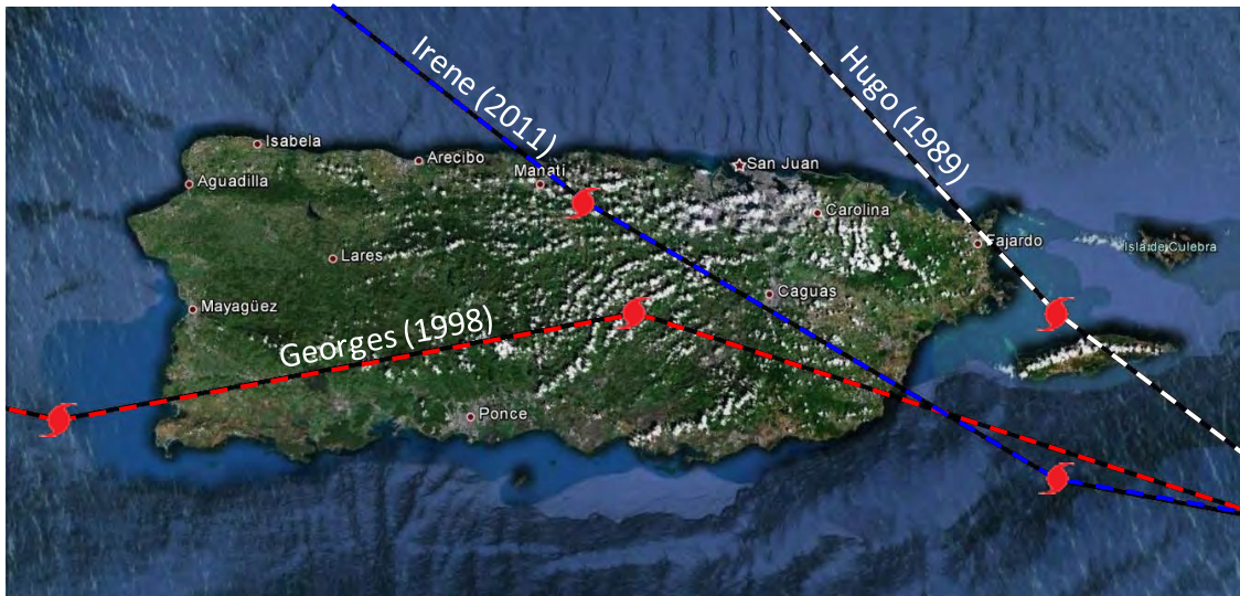
Figure 1: Major hurricanes to impact Puerto Rico

Hurricanes in the North Atlantic Basin cause widespread damage to the Caribbean islands on a regular basis. Puerto Rico is highly susceptible to landfalling hurricanes that usually move in an east to west direction across the island. The last two major hurricanes to impact the island are Hurricanes Hugo (1989) and Georges (1998), each causing significant damage (Figure 1). More recently, Hurricane Irene (2011) made landfall as a category 1 hurricane but did not cause significant damage.