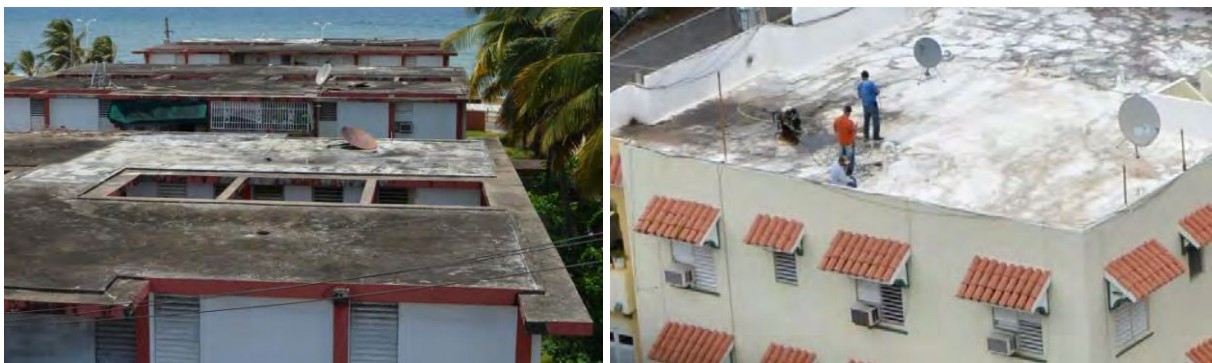
Figure 3: Typical reinforced concrete roof deck

The roofs are reinforced concrete decks that are generally five to six inches thick. They are essentially flat with a minimal slope for water drainage (Figure 3). Most roofs are covered with either paint or a chemical that combines with the concrete to prevent leakage. When a built-up roof cover is used, the cover is a thermoplastic polyolefin (TPO) membrane or something similar. Gravel is almost never used on the roofs of MFD buildings, even when the roof cover is built-up. Parapets are also common and generally range from a few inches to four feet in height.