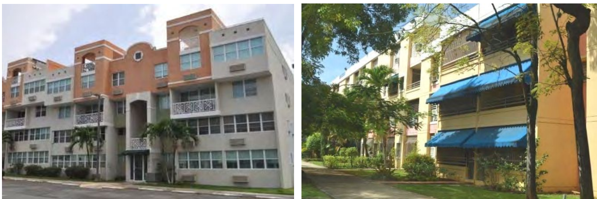
Figure 2: Typical "walk-up" multi-family dwellings in Puerto Rico

In Puerto Rico, multi-family dwellings with 2-4 stories are referred to as "walk-ups" because there are no elevators and occupants use stairs to access the upper floors. Figure 2 shows a typical "walk-up" in San Juan, Puerto Rico.