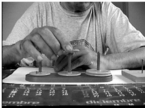
Figure 1. The patient working with the Tower of Hanoi

The treatment followed the theoretical framework of dynamic assessment (Bacigalupe, Lahitte & Tujague, 2011).