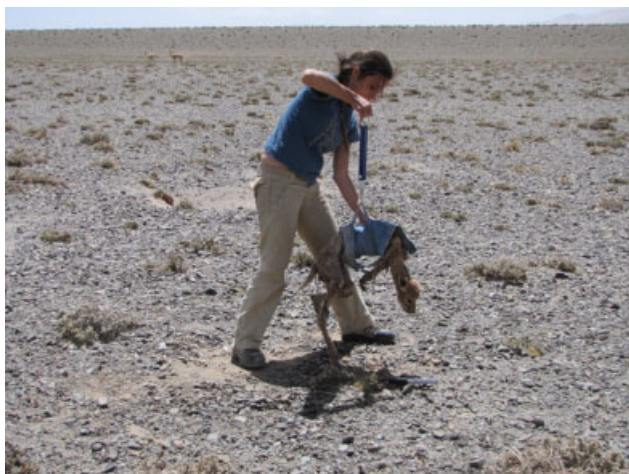
Figure 2. Weighing a 10-minute-old hand-captured vicuña at San Guillermo National Park, Argentina, January 2010.

close to where the mother was last observed. Reuniting was considered successful when 1) the female led the neonate away, or 2) the female ran from sight during capture, but the neonate was observed the next day accompanied by, or nursing from, an adult.