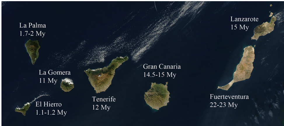
Figure 1. Map of the Canary Islands showing their geological age according to Carracedo et al., (1998) and van den Bogaard (2013).

single island endemics, but a few are present in two or three islands. The synanthropic D. crocata Koch, 1839 has also been reported on most of the islands.