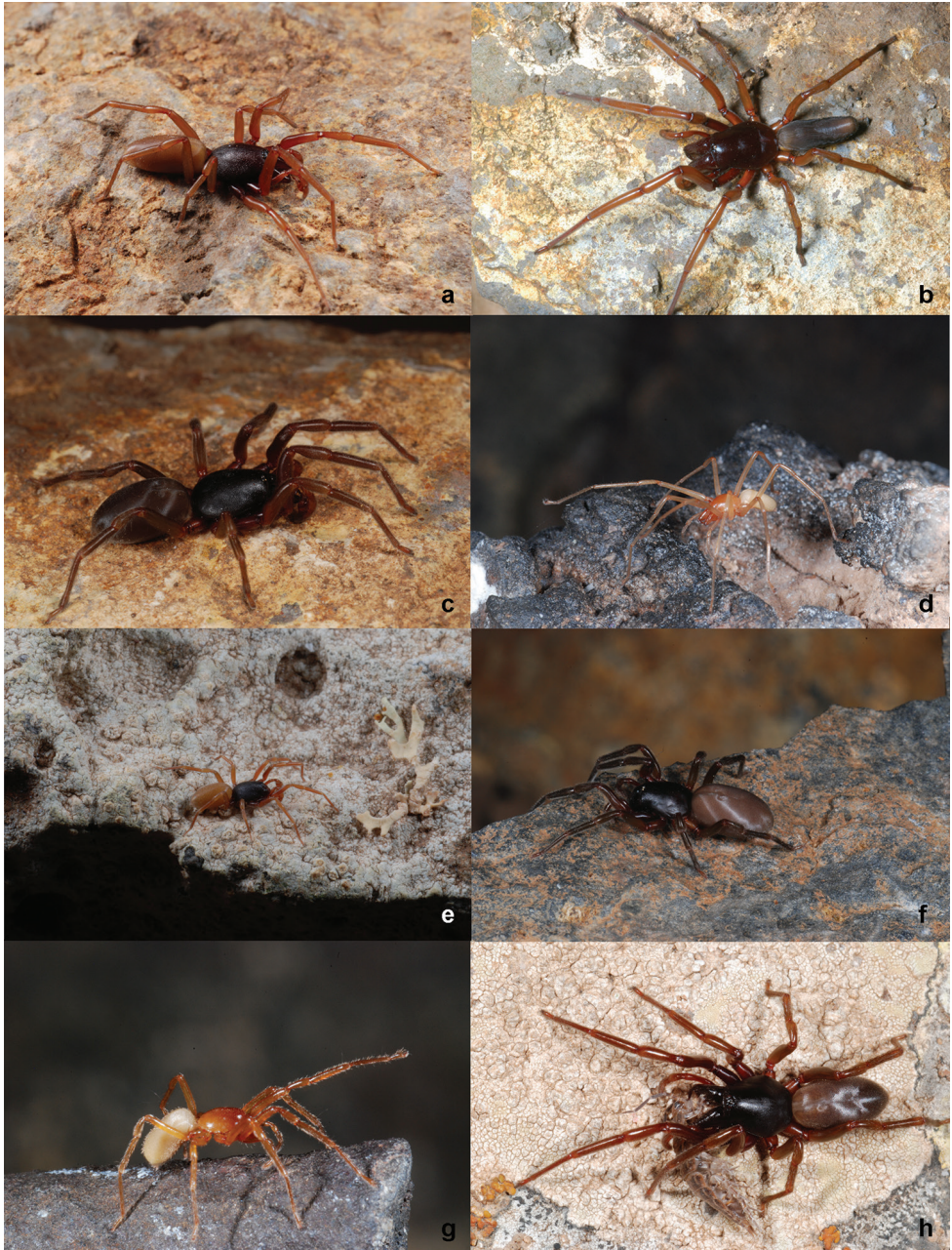
Figure 2. Habitus of some Dysdera species: a D. calderensis b D. longa c D. verneai d D. unguimmanis e D. minutissima f D. arabisenen g D. sibyllina h D. silvatica .