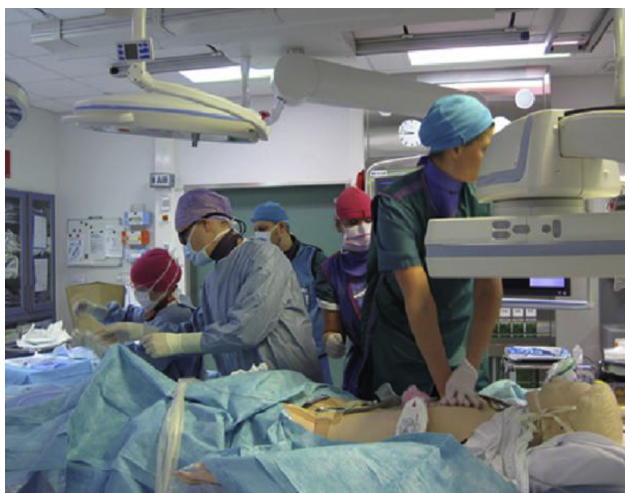
Fig 1. Simulation session situated in the hybrid suite.

In each simulation session, the time between the arrival of the patient to the OR and the placement of the occlusion balloon is recorded (door to occlusion time).