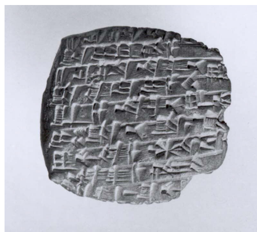
Figure 1: Old Assyrian cuneiform clay tablet (Spar, 1988)

In this paper we investigate automated phonological transcription of transliterated Akkadian texts. Conceptually, transcription consists of two subtasks. For syllabically spelled words which contain only syllabic cuneiform signs, transcription is a string transduction task closely related to grapheme to phoneme (G2P) conversion. For logograms,