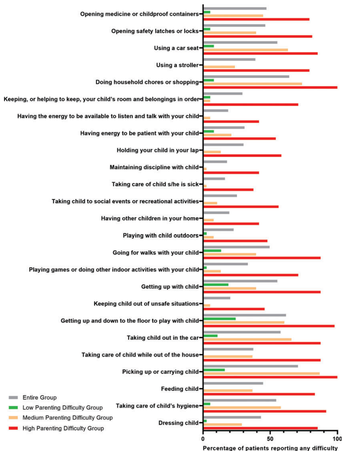
Figure 1 Histogram showing the percentage of patients (%) that reported any difficulty for different domains of parenting. Results are shown for the entire group of patients and for the different parenting disability states at 12 weeks postpartum.