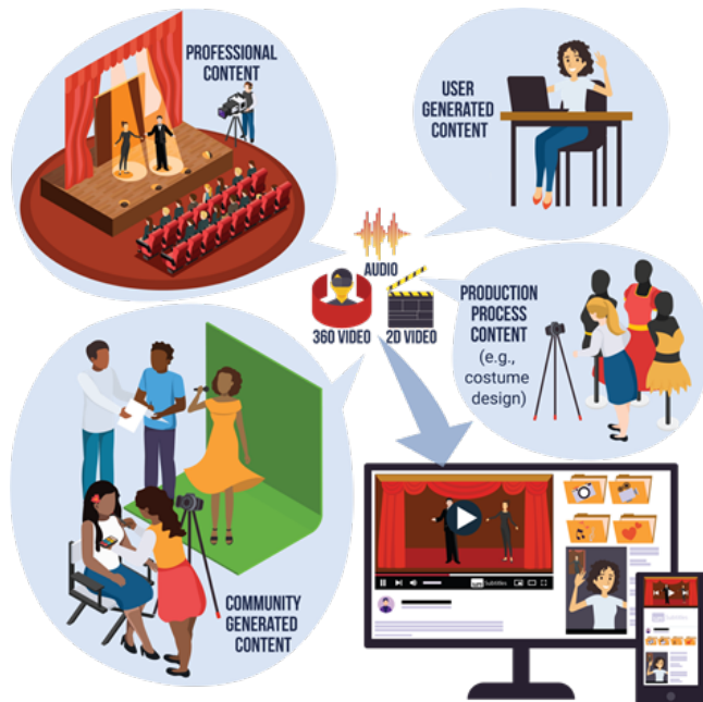
Figure 1: Sketch diagram of the Media Vault

geographical area at edge locations to ensure data is always available in closest-possible proximity to end-users. Caching of the data also minimises direct reads at the file storage system, thereby reducing cost.