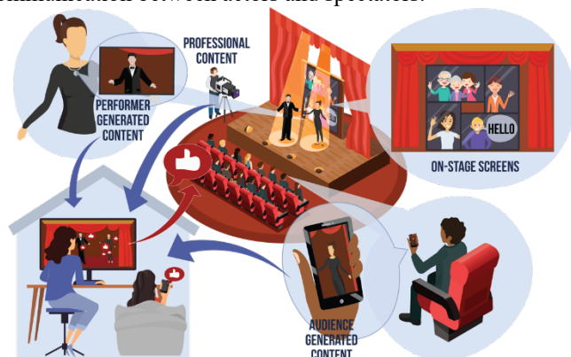
Figure 2: Sketch diagram of the Performance Engine

The Performance Engine is a communication infrastructure, deployed at the theatre or in the rehearsal rooms. It enriches the live performance by orchestrating in real-time the stage. It allows for remote participants to see the show and to directly contribute to it. This communication infrastructure does not only enrich the show, but enables as well synchronous communication between actors and spectators.