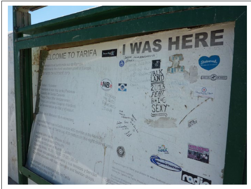
Figure 3. Information sign at Punta Tarifa (image by Abel Albet-Mas, 2014).

tunnel as the best option to physically connect Europe and Africa across the Strait of Gibraltar. In the framework of this project, a railway connection through a submarine tunnel would connect Punta Malabata (near Tangier, in Morocco) and Punta Paloma (which is actually within the municipality of Tarifa, in Spain). In this case, as also occurred with Sörgel's Atlantropa, the borderscape of Punta Tarifa is right in the middle of Euro-Africa linking megalomaniac fantasies.