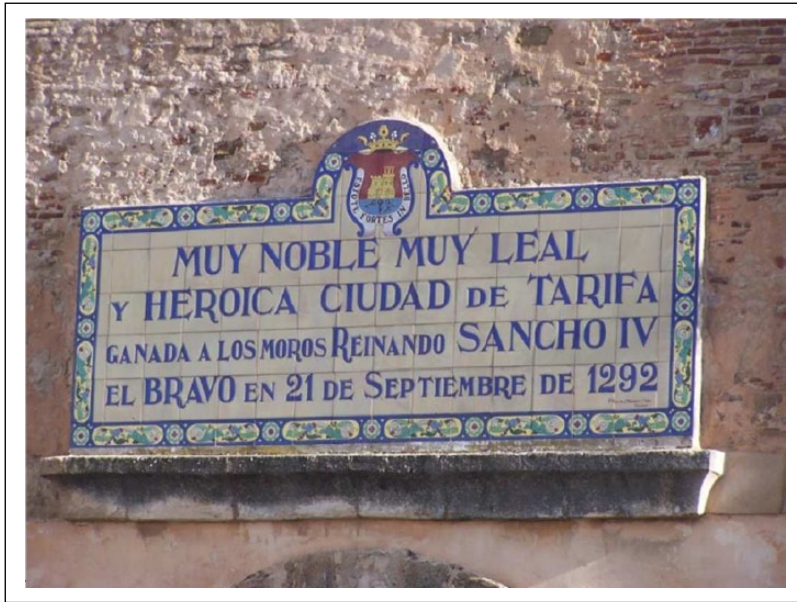
Figure 4. Memorial plate in Tarifa (translation: ‘The very loyal, noble and heroic city of Tarifa. Won to the Moors while under the reign of Sancho IV “the brave”, on September 21st, 1292’).