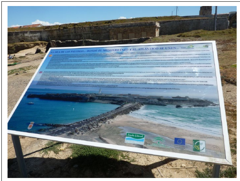
Figure 5. Information sign describing the landscape of Punta Tarifa, with no reference to the Migrant Detention Centre (image by Abel Albet-Mas, 2014).