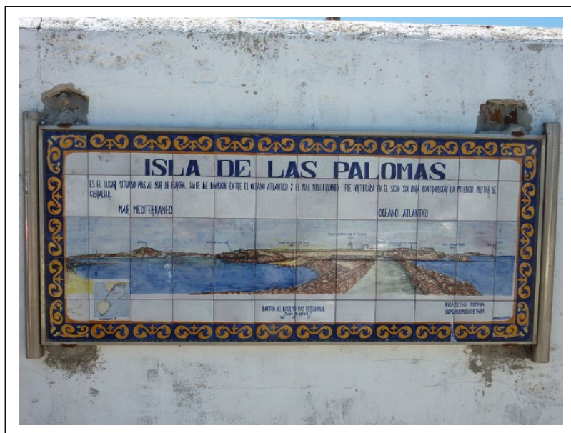
Figure 7. Information sign describing the landscape of Punta Tarifa, with no reference to the Migrant Detention Centre.

migrants. In 2002, it was re-opened under the implementation of the System of Integrated External Surveillance (SIVE) on the Spanish southern coasts. Since the establishment of the Migrant Detention Centre of Algeciras in 2003, the centre of Punta Tarifa started to operate as a complementary module, as an extension or annex of it. Based on this ‘emergency’ and provisional nature, Punta Tarifa is still not recognised as a ‘formal’ Migrant Detention Centre. Rather, the centre in Punta Tarifa should be counted as one of the various improvised detention camps currently functioning in Spain. 6 They operate together with the officially recognised Spanish Migrant Detention Centres. 7 And they are part of a growing archipelago of centres that have been mushrooming across the EU and beyond over recent years (Figure 7). 8