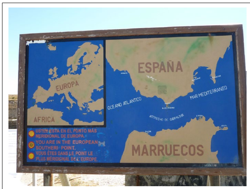
Figure 1. Information sign at Punta Tarifa.