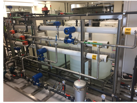
Figure 1: The Secure Water Treatment (SWaT) testbed

Summary of Contributions. We present active fuzzing, a black-box approach for automatically discovering packet-level network attacks on real-world CPSs. By iteratively constructing a model with active learning, we demonstrate how to overcome enormous search spaces and resource costs by sampling new examples that maximally improve the model, and propose a new algorithm that guides this process by seeking maximally different behaviour. We evaluate the