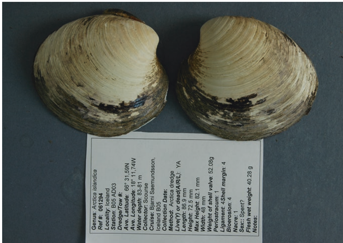
Fig. 21.3 Shell valves of a 507-year old specimen of Arctica islandica collected near Grimsey island, north of Iceland in 2006, with processing notes.

depends on access to similarly high resolution instrumental and proxy data for assimilation (Fang and Li 2016; Phipps et al. 2013). Suitable methods are already being used for modeling of terrestrial systems using proxies from tree-rings (Breitenmoser et al. 2014; Loader et al. 2013) and speleothems (Baker et al. 2012) and for tropical marine systems using proxies from corals (Evans et al. 1998), and more recently it has been demonstrated that reconstructions of marine climate using bivalve shells can provide high resolution real world data for the temperate and boreal oceans that can be used to test and constrain coupled climate models (Pyrina et al. 2017; Emile-Geay et al. 2016; Swingedouw et al. 2015).