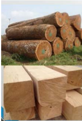
Fig 1: Nigerian Iroko Timber.