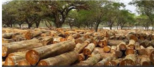
Figure 2: Australian Teak wood

Apart from Iroko, there are several other Nigerian timber species that are yet to be explored for structural use.