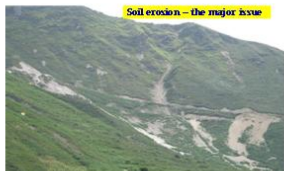
Figure 1: A generalized view of soil erosion in hilly terrain