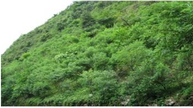
Figure 2: Pigeonpea on the hills