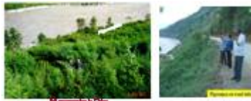
Figure 4: Pigeonpea on river bank