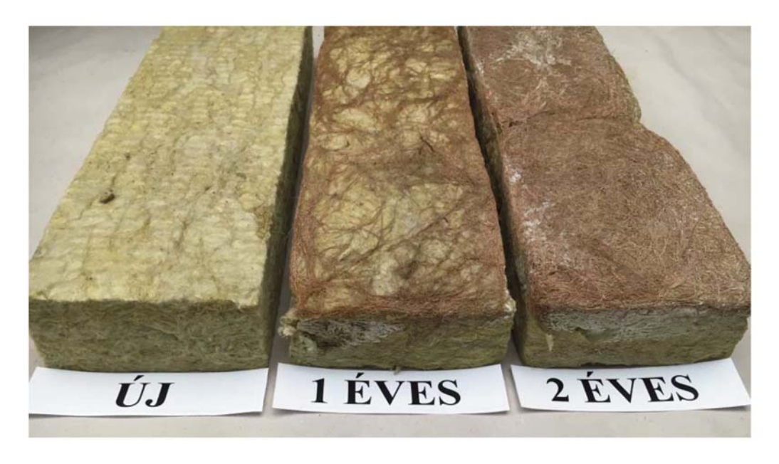
Figure 3. Rockwool slabs (upside down) from the experiment: before usage (left), after the first growing season (center), after two growing seasons (right)