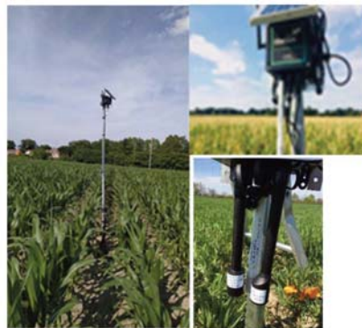
air temperature, humidity, pressure, CO 2 and ammonia