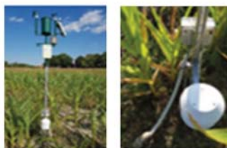
air temperature, humidity, wind speed, precipitation and global radiation