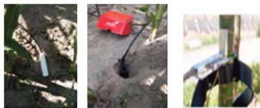
soil temperature, EC, moisture, oxygen and stalk diameter