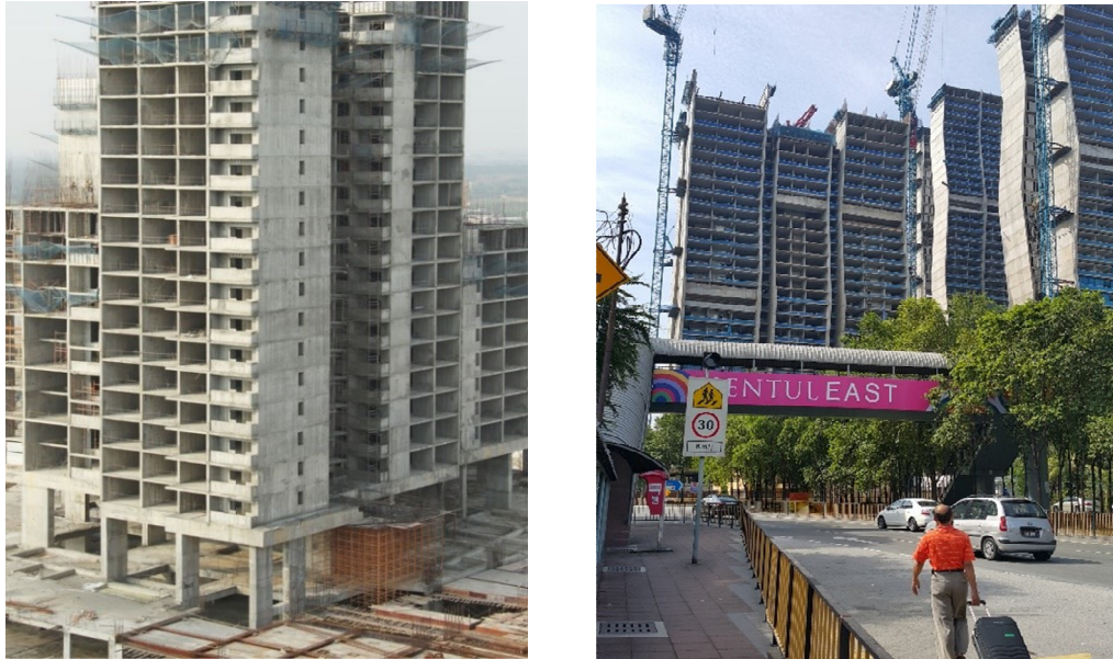
Figure 1.1 Construction of Multi Story Wall Beam System

Wall beam system is defined as one of the construction methods using reinforced concrete wall (shear wall cast in-situ) and precast / pre-stressed slabs and beams, instead of using conventional columns as shown in Figures 1.1 and 1.2.