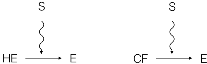
Figures 4a, 4b. The wavy line represents another way systemic and proximate causes interrelate. This amplifying/damping relation holds when changes in a variable influence the strength of other causal relations, rather than the values the variables take on. The wavy line is not a part of standard method of constructing directed acyclic graphs.

relationship in Figure 4 with the wavy line, and in Figure 5 in the standard framework for directed acyclic graph.