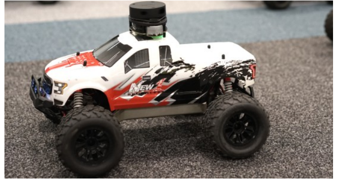
Fig. 2. Prototype car with Lidar running on top, used for the experiment

The use of Cloud services facilitates generic control instructions to the robot and stable operation [24]. For example, factory managers can easily have an overview of the position of different robots around the factory floor, or override autonomous roaming to involve more robots assigned within a certain group or to prioritize specific tasks. Besides, the Cloud allows global access for the administrators and mission