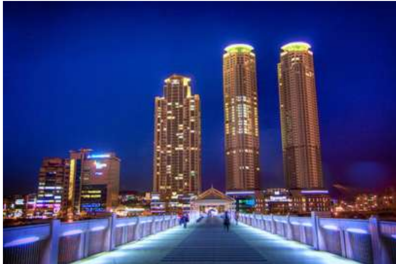
Figure1: Ulsan, Korea’s second-largest city, is leading the charge towards ecologically sustainable industrialization. Image Copyright: John Mathews (2012). http://theconversation.com/cities-will-drive-the-green-industrial-revolution-5827

This paper discusses the industrialized building system (IBS) and lists some of its advantages and disadvantages and also its components. Figure 2 shows the position of an industrialized building system (IBS) for a sustainable Eco town.