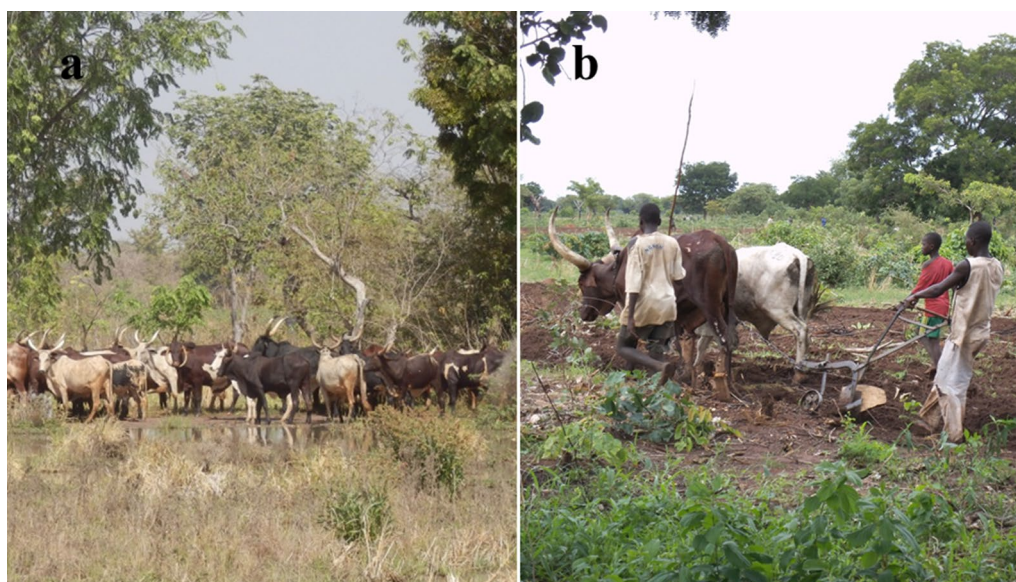
Fig. 2 Cattle in the Mandoul HAT focus. a Mbororo transhumant cattle grazing in marshland. b Sedentary cattle used for animal traction

Secondly, the objective is to work out the costs of a control, rather than a research operation. The tiny target projects undertaken to control HAT in Chad, Côte d'Ivoire, Democratic Republic of Congo, Guinea and Uganda [21,