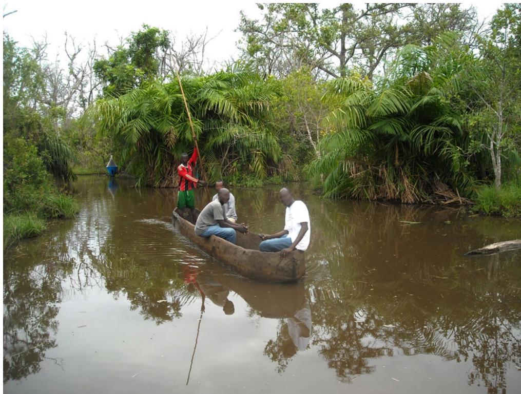
Fig. 5 Accessing target deployment and trap monitoring sites by canoe (note the biconical trap just behind the canoe)

about the tiny target operation and distribute leaflets to them. The cost of these two operations came to USD 6551 working out at USD 7.8 per km 2 (Table 4).