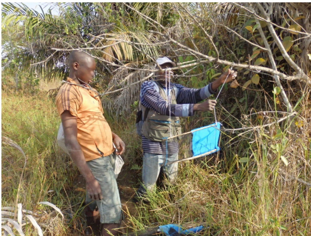
Fig. 4 Target deployment

At the end of 2014, further sensitisation work was undertaken. The CSSEs were revitalised: contacted and made aware of the upcoming second target deployment in January 2015. The radio spot was again broadcast, but only twice daily, for between three and seven days. As the CSSEs were village-based, it was felt that further outreach was required to inform the transhumant pastoralist populations who migrate into the area during the dry season with their stock. Furthermore, it became evident that the hanging targets were sometimes displaced by cattle, which caught them in their horns when going to the marsh to drink. Thus, in March 2015, it was decided to inform pastoralists