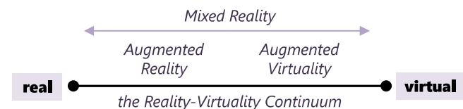
Figure 2: Illustration of Milgram et al. ’s [50–52] RV Continuum, which we reproduce in this work since it represents the foundation for our ARTV Continuum from Figure 4.

In 1994, Milgram and Kishino [51] introduced the “Virtuality” continuum, an imaginary line having the real and virtual worlds at its opposite ends. Later, Milgram et al. [50,52] referred to this line as the “Reality-Virtuality (RV) Continuum,” the name in use today. As one moves along the RV Continuum, the degree of interpolation between the real and the virtual changes, leading to Augmented Reality (AR) and Augmented Virtuality (AV) world mixtures; see Figure 2. In fact, the primary environment or “substratum” that is augmented determines the distinction between AR and AV. Everything in the RV Continuum, except its ends, was defined as Mixed Reality (MR), a “more encompassing term to supplement the existing definition of Augmented Reality (AR), which leads us to propose definitions of the associated concepts of Augmented Virtuality (AV) and then Mixed Reality (MR)” [50].