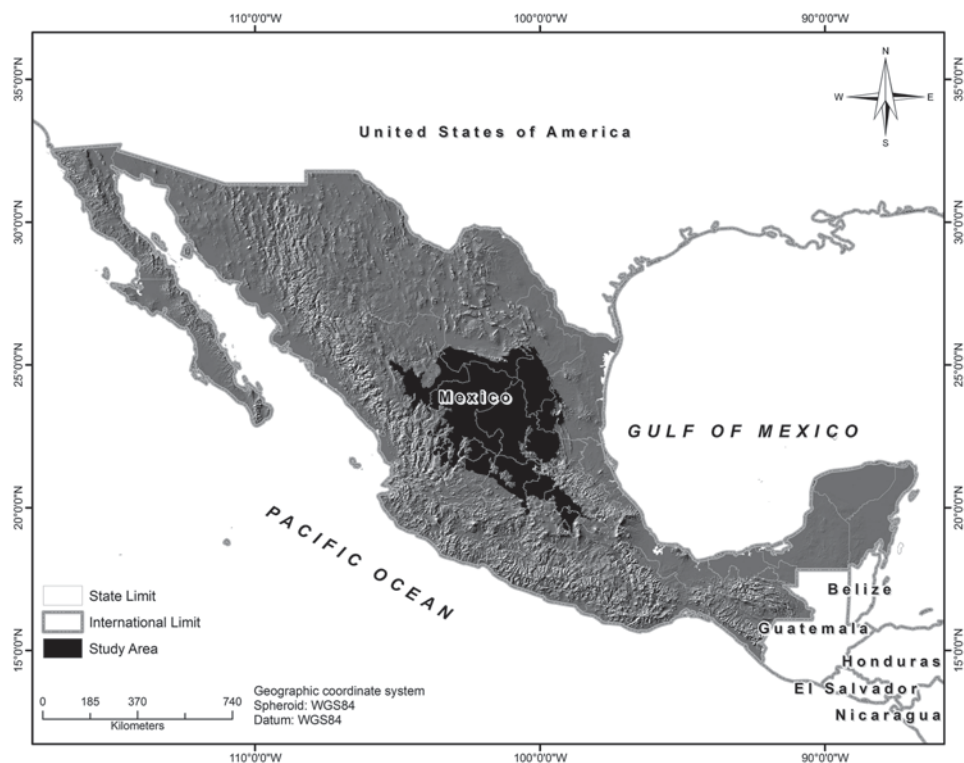
Figure 1. Location of the modelled area. The black region corresponds to the 'Meseta Central Matorral' (MCM), delimited as 'M' according to Soberón and Nakamura (2009).