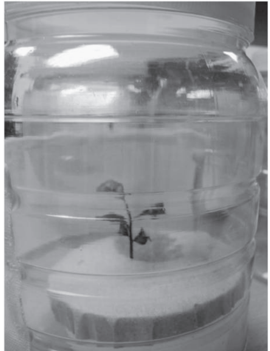
Fig. 3. 'Cleopatra' mandarin seedling placed into a bioassay chamber.

For the direct spray method the adult insects were collected in their resting positions from the reproduction chamber using an oral aspirator. Each group of 10 individuals was placed in a 250 mL plastic container. To facilitate the application of spore suspensions, the psyllid adults were kept in a refrigerator for 10 min at 7 °C, and