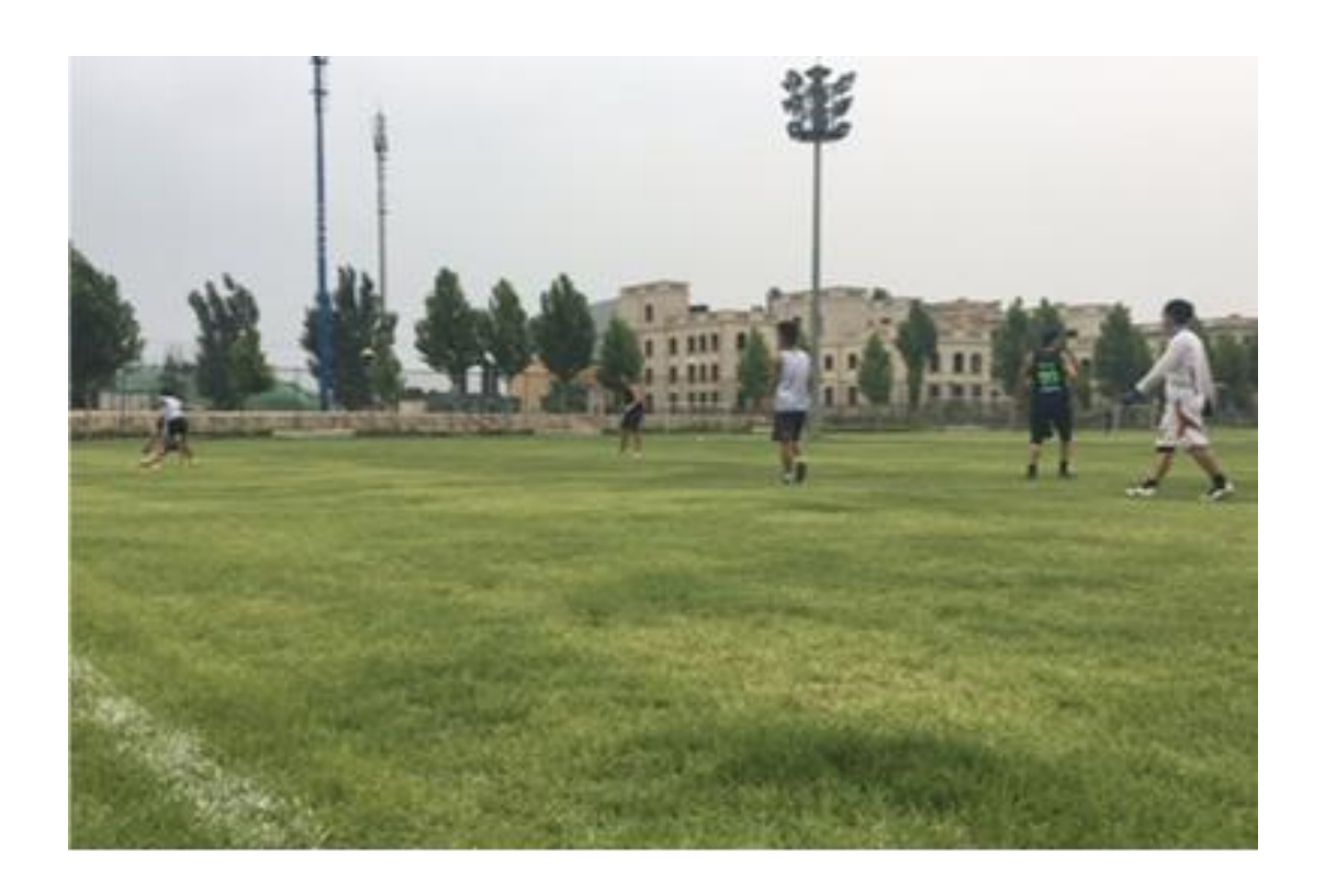
Figure 2: People playing frisbee on a grass field, September 2019.