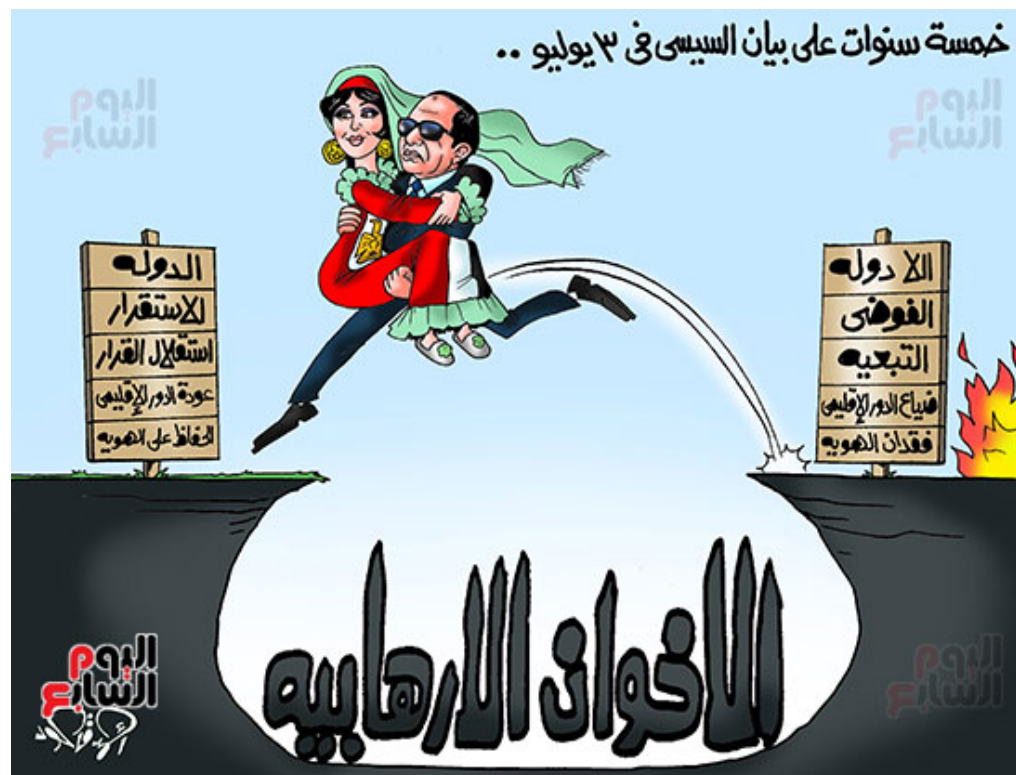
Fig. 4: Five years since Sisi's statement on July 3.

President Morsi as a courageous military achievement to save the nation from chaos induced by self-interested civilians. The nationalist operetta that has been most widely played following the coup, Tislam el-Ayādī , Tislam ya Geish Bilady ( Bless the Hands of my Nation's Army ), sung collectively by several well-known singers, puts "the great Egyptian military" at the center of the definition of patriotism