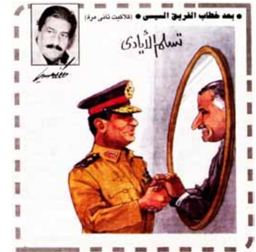
Fig. 1: Sisi has been likened to Nasser as the savior of the Egyptian nation, through his military coup.

Imagining and constructing the Egyptian nation as a woman and the use of family metaphors in Egyptian nationalist discourse are not new. Beth Baron shows that it began with the first manifestations of an Egyptian territorial sense of nationhood in the late nineteenth century. Nor is it unique to Egypt. However, as Baron remarks, “the prevalence of familial metaphors in