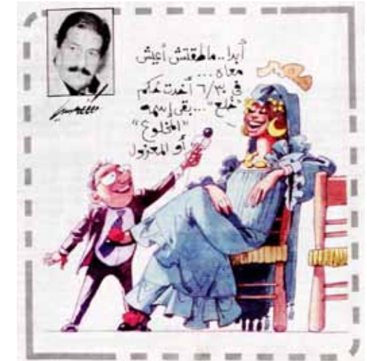
Fig. 6: Mostafa Hussein's cartoon in al-Akhbar . Egypt: "I could not stand living with him [...] on June 30 I got a divorce [...]"

But the Sisi-era post-coup nationalist narrative differs from its Nasser-era predecessor in one important way; having forcefully replaced the first democratically elected president, two years after the largest mass mobilizations for democracy in the country's history, the military-backed regime has sought legitimacy by portraying its opponents as the enemies of the nation, as the agents of an outside conspiracy against Egypt. Moreover, the regime's adoption of economic policies that have exacerbated social inequalities and impoverished much of the population 20 has induced it to also vilify demands for social justice that were at the heart of the January 25 mobilizations. Critics of the