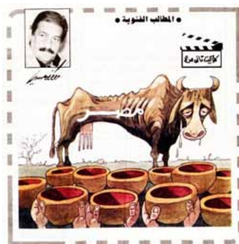
Fig. 7: “Al-maṭālib al-fi’awiyya” ( sectoral demands ).

constructing a personified depiction of Egypt, in which Egyptians exist outside it and abuse it. Speaking on TV as a presidential nominee in 2014, responding to a question about difficult economic conditions, he asked the Egyptians in reproach, “Are you going to eat Egypt? Do you want to kill her?” (Al-Hadidi and ‘Issa, 00:48-00:54). When the state engaged in 2017 in a campaign of confiscating land deemed to be the land of the state unlawfully occupied by individuals, Sisi proclaimed, “this [land] does not belong to you. It belongs to Egypt. It is not ours. I am not authorized to give it to you” (dmc, 0:43-0:51). Egypt becomes divorced from its current population, and Sisi’s love for her becomes a