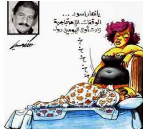
Fig. 9: Man: "Oh no! Too many 'rallies' these days."

ment by Sisi in a speech addressing the military on the anniversary of the October War epitomizes this negative feminization; commenting on the difficulties Egypt was now facing in reaching an agreement with Ethiopia on building a dam that could compromise Egypt's water supply, he blamed the uprising of January 25, proclaiming that, "in 2011 [...] because the country revealed her back and stripped her shoulders, anything could now be done to her" (eXtra news, 0:51-1:13), portraying the revolutionary movement for democracy and social justice as an invitation by a promiscuous woman to be penetrated by outsiders. Similarly, one cartoon by Mostafa Hussein depicted the street rallies ( al-waqafāt al-ihtijājiyya ) as a