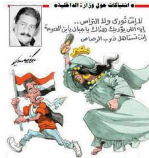
Fig. 8: Cartoon by Mostafa Hussein commenting on clashes between protesters and the police in 2012. Egypt to protester: "You are not a revolutionary. What takes you there, you coward! You deserve to be shot." Source: Akhbar al-Yawm.

mother Egypt is glorified as a superior unique nation, the best that ever existed. The preamble to the 2014 constitution, drafted soon after the July 2013 coup, described Egypt as "the gift of Egyptians to humanity", "the heart of the whole world [...] the meeting point of world civilizations and cultures", "the most amazing wonder of civilization" (3), etc. This national self-glorification is coupled with a disdain for lay Egyptians, particularly towards insubordinate civilians, who now have all the traits of a woman degenerating into resisting her patriarch's authority. A state-