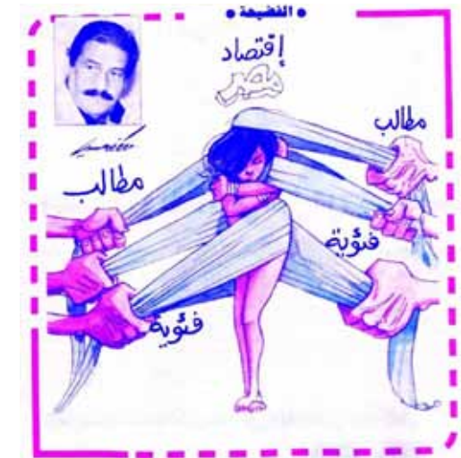
Fig. 10: "The Scandal": sectoral demands stripping "Egypt's economy" of her clothes.

woman protesting to her sleeping husband, while her appearance insinuates that she is demanding sexual intercourse (see fig. 9). On the other hand, those men making what came to be termed sectoral demands on Egypt, i.e., demands for economic rights, are depicted as stripping Egypt of her clothes, exposing her and making her vulnerable to rape, rather than fulfilling their masculine role of defending and protecting her ird , as depicted in one of Mostafa Hussein's cartoons (see fig. 10).