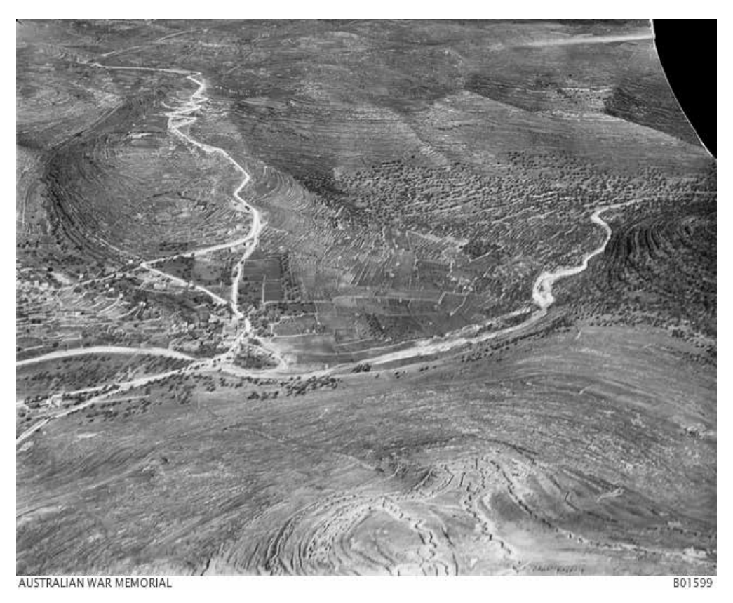
Figure 3. An aerial view of the Turkish defenses of Jerusalem taken from an aircraft of the Australian Flying Corps (1918), Australian War Memorial, online at www.awm.gov.au/collection/C969258 (accessed 15 June 2020).

The difficulty of reconciling these visions persists; photography theorist and critic Allan Sekula was particularly critical of the retrospective use of Steichen's aerial reconnaissance photographs from the war for aesthetic contemplation in galleries and museums, arguing these images once served an instrumental functional purpose and required specialist decoding and interpretation. This is typical of a reading of the medium of photography that highlights the contextual significance of the image for its ideological understanding.