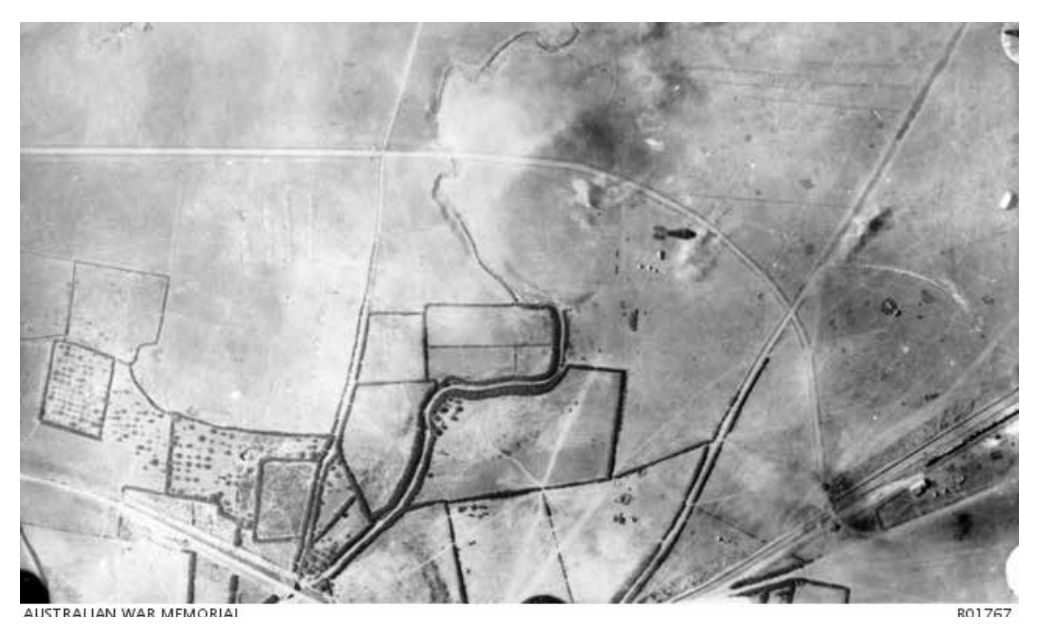
Figure 1. A photograph taken from the air during the bombing of Jenin, showing a bomb dropping from a plane (1918), Australian War Museum, online at www.awm.gov.au/collection/C972279 (accessed 15 June 2020).

Here aerial photography acts in a mode distinct from traditional war photographs recorded by bystanders to the event or its aftermath. It constitutes a crisis of representation, in which the visual scale of aerial imaging allows the context of the action to be understood holistically, but which also completely distances the viewer from consequence. The flattening of the landscape generated by the verticality of the aerial photograph engenders an aesthetic quality to the image founded on the ordering principles of geometry, as well as the emerging conceptual tenants of abstraction. As such, these early aerial photographs undermined the presumed realism of the camera. Hüppauf notes how the merging of new technologies of photography and aviation in war profoundly impacted on perceptions of landscape and space, transforming the profusion of worldly details into ordered and abstract patterns. <sup>14</sup>