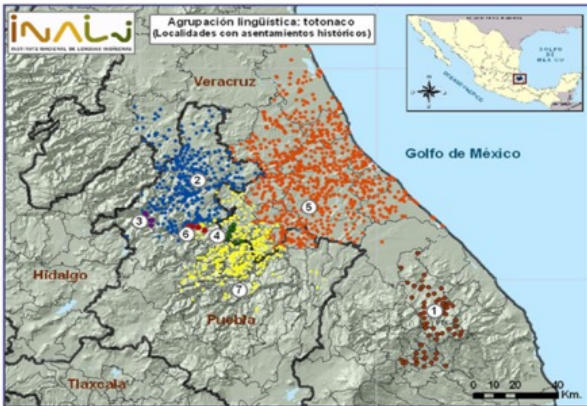
Figure 3. Distribution of the Totonaca language grouping, according to localities where it is spoken of the State of Veracruz and State of Puebla, 2010