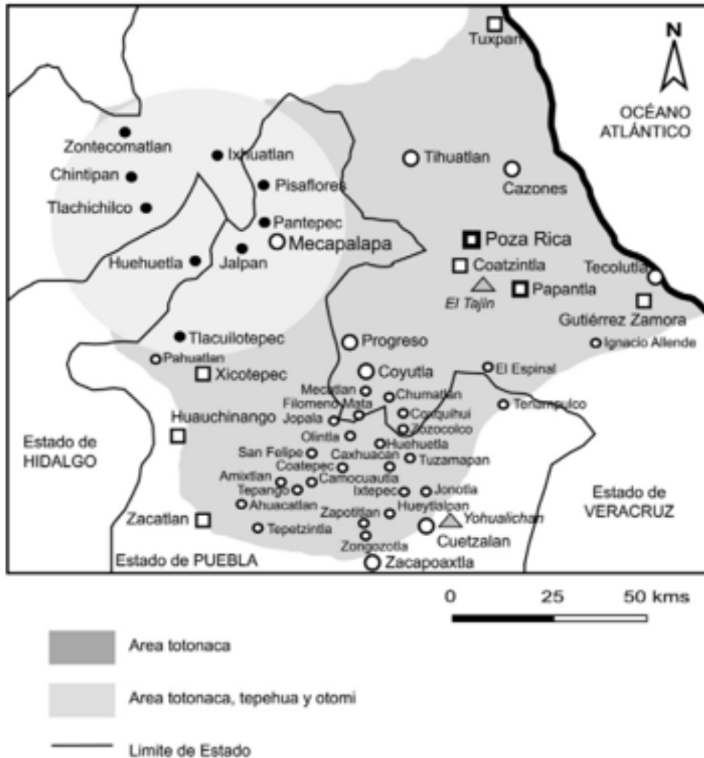
Figure 2. Totonacapan region