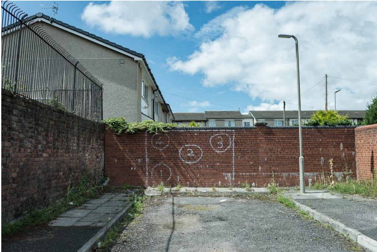
Urban goals – Toxteth, Liverpool

maintenance, resulting in loss of control and a possible reduction in skills, goodwill and quality. This situation has also led to increased costs for football clubs to play on facilities set by local authorities.