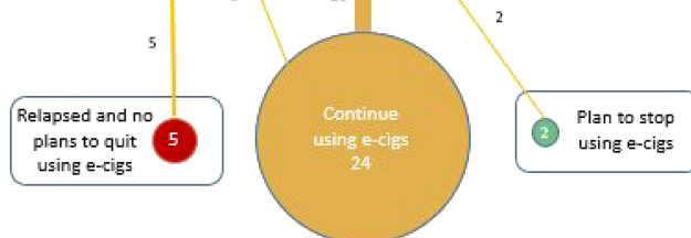
Figure 1 Long-term trajectories of e-cigarette use and reported co-existing tobacco use. [Colour figure can be viewed at wileyonlinelibrary.com ]